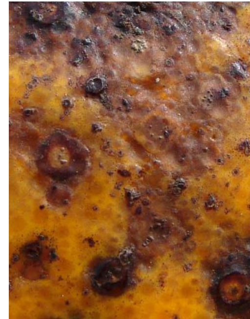
Symptom type # 3- "Virulent spot" Fusion and expansion of many lesions covering part of the surface of heavy infected fruits giving a leathery appearance. May cause premature fruit drop and serious post-harvest losses.