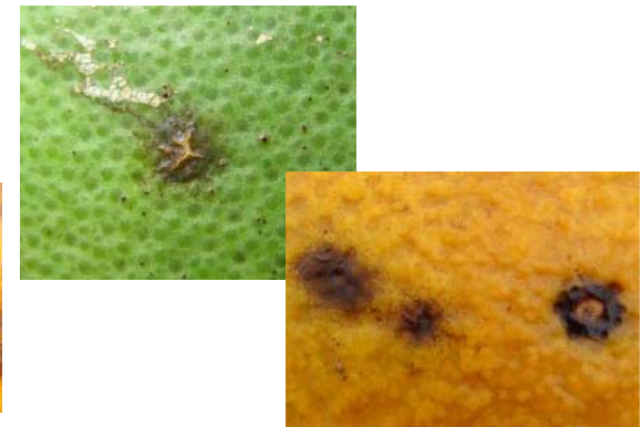
Symptoms on green fruit that can become hard spots later in the season.