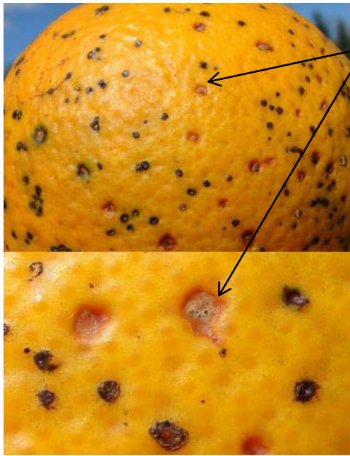
Symptom type # 2- "Freckle spot" or "early virulent spot". Reddish or colorless spots lacking a halo which are a sign of heavy infection.