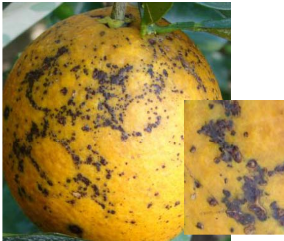
Symptom type # 4- "False melanose" or "speckled blotch". Usually appears on green fruit.