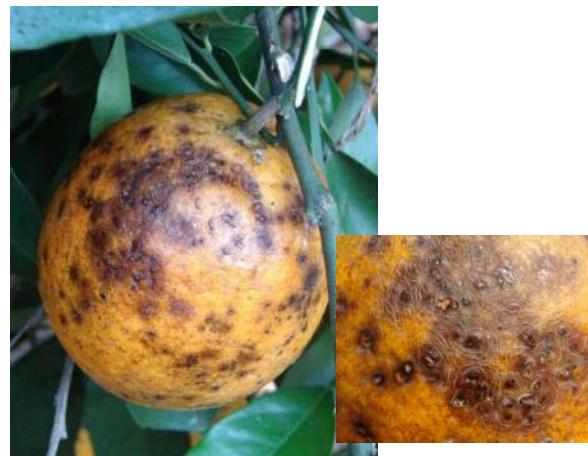
Symptom type # 5- "Cracked spot". Lesions with cracked surface and irregular margins.