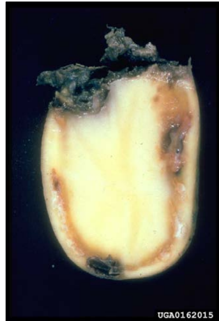
Figure 5: A potato tuber that shows symptoms of slime ooze and browning of the vascular rings caused by Ralstonia solanacearum .