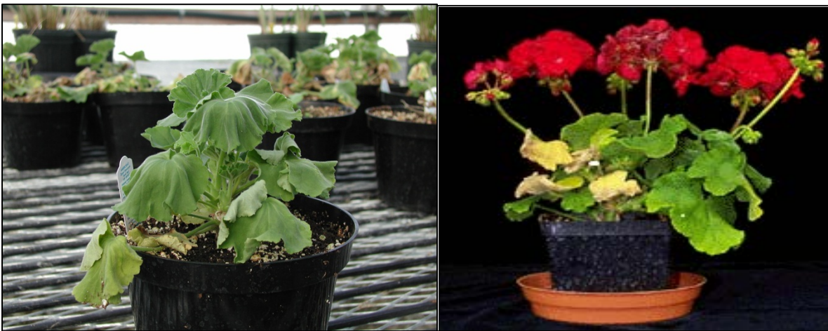
Figure 3: Left: geranium showing early wilting symptoms caused by Ralstonia solanacearum R3 Bvr2. Right: A geranium showing yellowing symptoms caused by Ralstonia solanacearum R3 Bv2.

In geranium: Symptoms of southern wilt on geranium can be subtle and easily overlooked. Symptoms usually begin with chlorosis and wilting of the lower leaves, then progress to an upward curling of leaf margins that is very characteristic. Under favorable conditions, the disease develops rapidly on geraniums and wilting may move upwards from older to younger leaves. Wilted leaves often develop wedge-shaped areas of chlorosis that become necrotic. The leaf margins may also become chlorotic, then necrotic, and the whole plant may desiccate and die. In late stages of disease, stems may collapse. Vascular discoloration is visible in stems (especially at the root crown) and roots; these can blacken and eventually become necrotic (Figure 3).