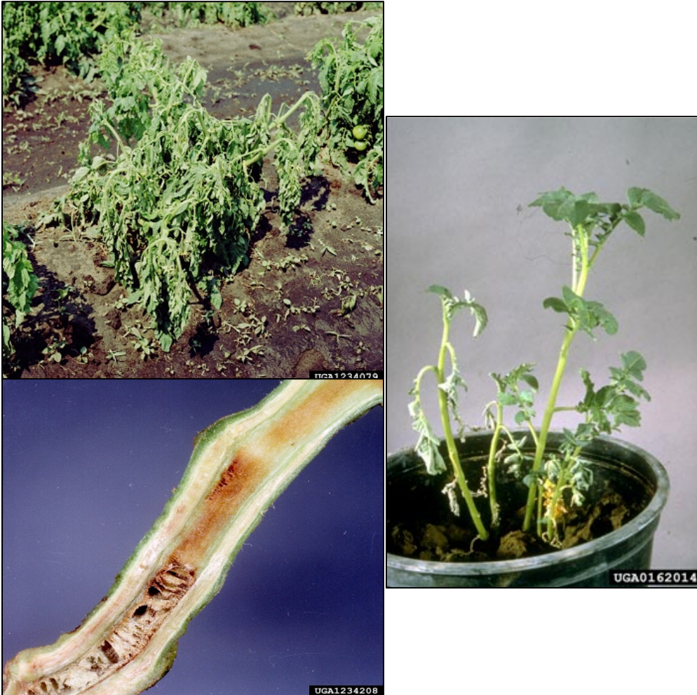
Figure 2: Generalized symptoms of Ralstonia solanacearum (all races/biovars) on tomato (left) and potato (right). Upper Left: Wilt symptoms on tomato. Right: Wilt symptoms on potato. Bottom Left: Vascular browning and brown streaks observed in a tomato stem.

al., 2005, 2007; Champoiseau et al., 2009). Wilted leaves are usually the first symptom observed followed by chlorosis and plant death (Champoiseau et al., 2009). The stem may collapse and gray-white bacterial ooze may be present on the stem, especially when the stem is cut or broken. Stems may also blacken (EPPO, 2004).