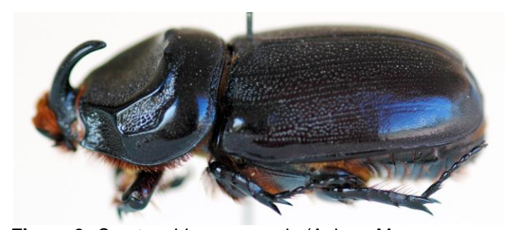
Figure 2. Oryctes rhinoceros male.