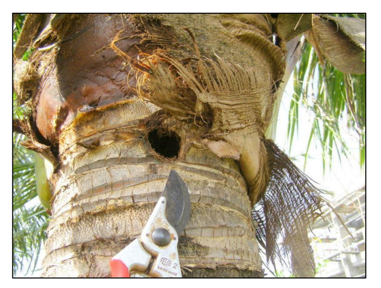
Figure 8. Feeding damage caused by CRB.

IMPORTANT: Permission must be obtained by the property owner before performing any destructive sampling of the palms. This should not be considered unless the palm is highly suspect (shows obvious damage or is dying).