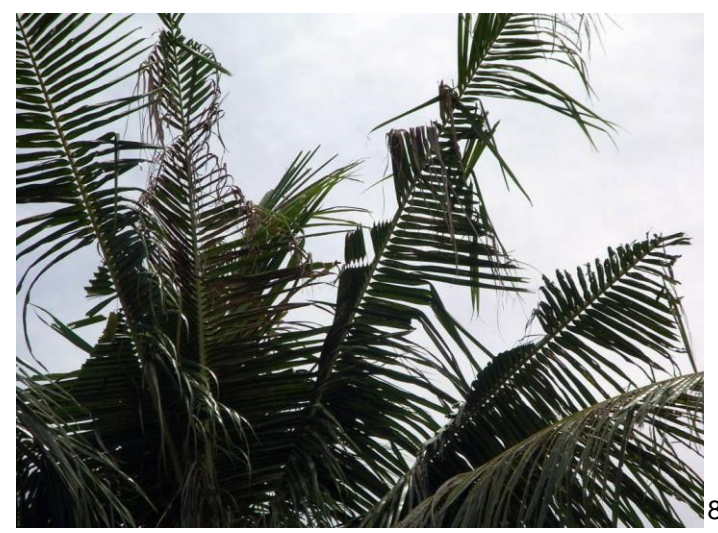
Figure 7. V-shaped cuts in fronds (Ben Quicocho, Guam).

Oryctes rhinoceros adults bore through developing leaves and cause V-shaped cuts that are very visible and distinctive (A. Moore, 2013, personal communication). Damage can appear as V-shaped cuts in the fronds or holes in the midrib. This type of damage is often the first sign of an O.