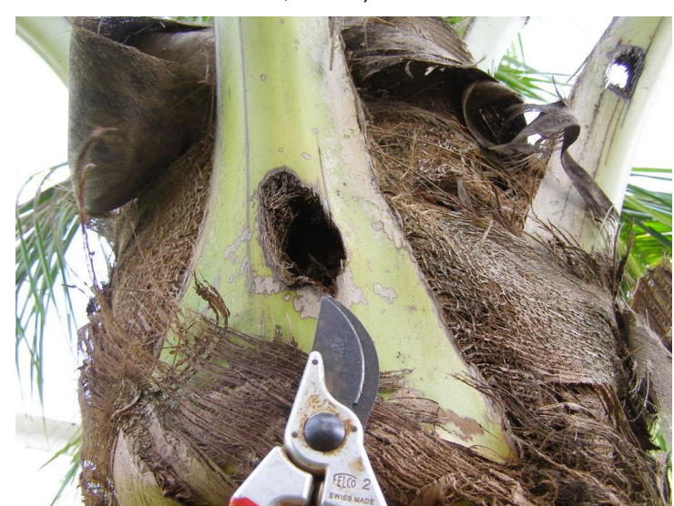
Figure 6. Feeding damage caused by Oryctes rhinoceros.