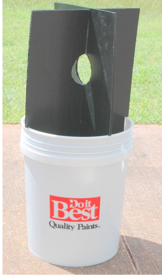
Figure 11. Vaned bucket trap (Aubrey Moore, University of Guam)