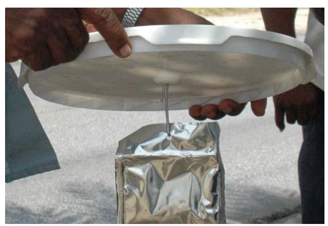
Figure 14. Lid of homemade bucket trap with hanging lure (Image courtesy of Amy Roda, USDA-APHIS).

For surveys in the urban environment, traps should be suspended from trees or poles.