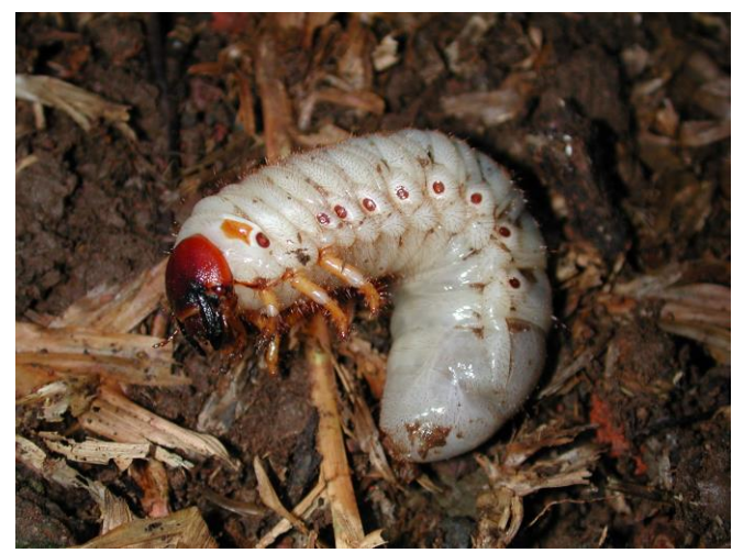
Figure 3. Larva of Oryctes rhinoceros.

Larvae: Newly hatched larvae are 7.5 mm long (approx. ^5/_{16} in) (Lever, 1979). "The large (60 to 105 mm long [approx. 2^{3}/_{8} to 4^{1}/_{8} in]) white mature larva is C-shaped, with a brown head capsule and legs. The posterior part of the abdomen is a bluish-grey colour" (Giblin-Davis, 2001). Larval instars are