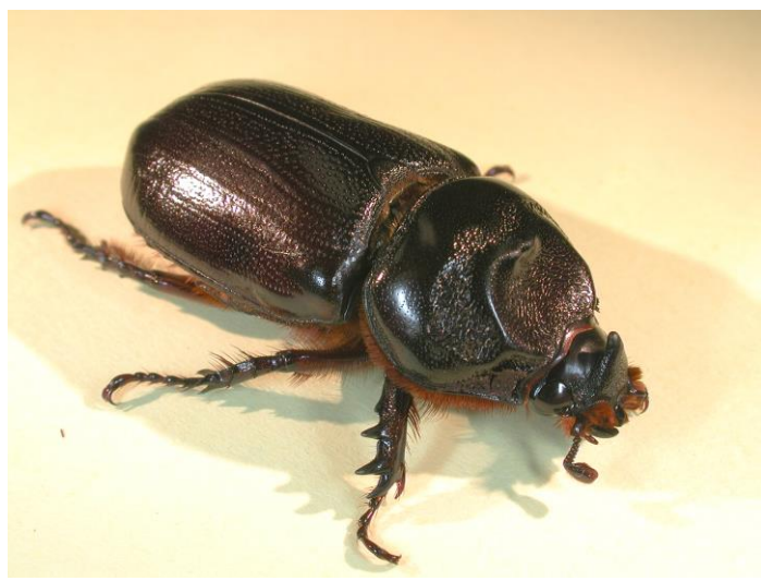
Figure 1. Oryctes rhinoceros female (Mark Schmaedick, American Samoa Community College).