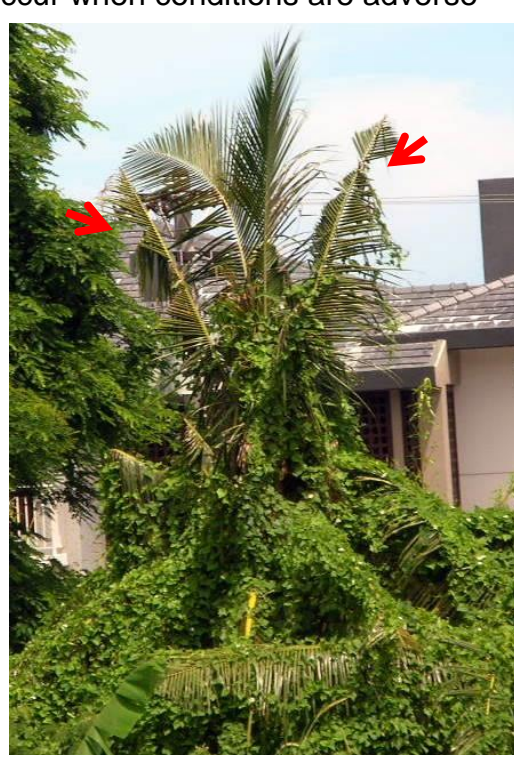
Figure 5. Palm damage caused by O. rhinoceros adults.

There is a positive correlation between abundance of larval food and damage by adults to palms. Outbreaks can be