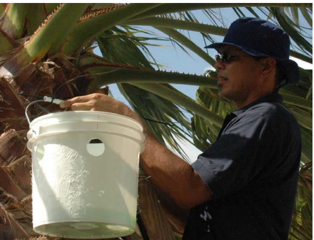
Figure 13. Homemade bucket trap with entrance holes (Image courtesy of Amy Roda, USDA-APHIS).