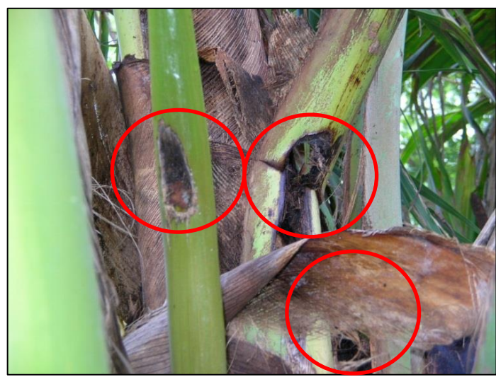
Figure 9. Adult feeding hole (Ben Quicocho, Guam).