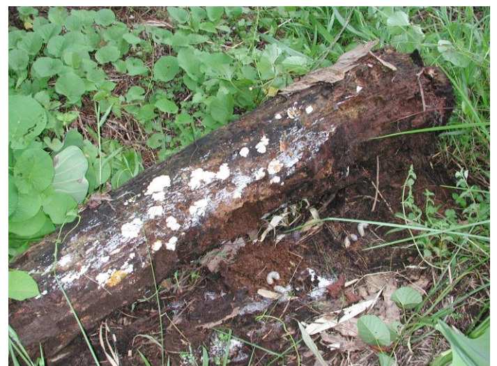
Figure 4. Breeding site of Oryctes rhinoceros under a coconut log.

Adults mate several times in dead or dying plant material (Catley, 1969), including decaying palm trunks (Zelazny and Alfiler, 1987). The females make a serpentine burrow in which they lay their eggs. According to Hinckley (1973), females can oviposit in "almost any log or heap soft enough for burrowing, yet firm enough to provide compacted frass". Females lay between 3 and 4 clutches of eggs with about 30 eggs per clutch (Hinckley, 1973), laying between 70 and 140 eggs total