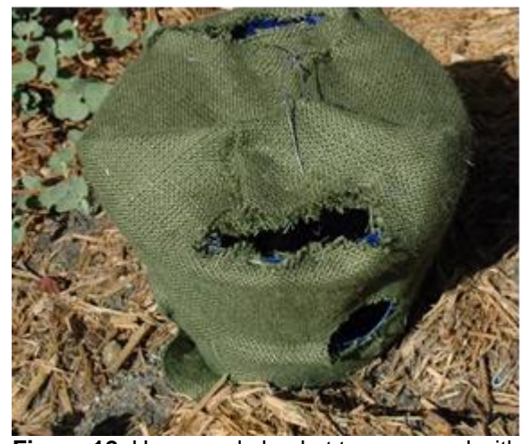
Figure 12. Homemade bucket trap covered with burlap.