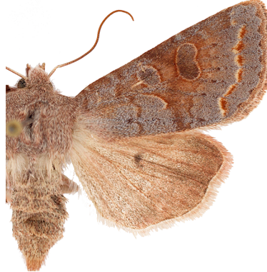
Fig. 15: Orthosia revicta .