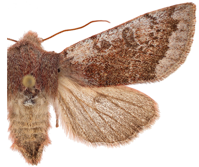
Fig. 10: Orthosia pulchella .