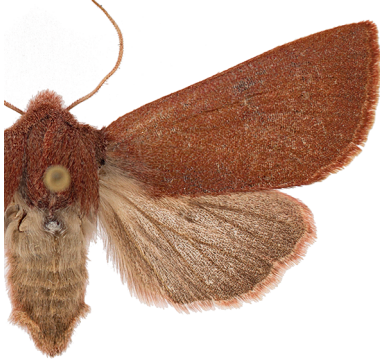
Fig. 11: Orthosia pulchella .