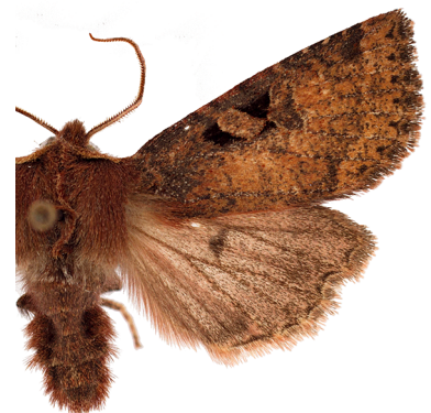
Fig. 13: Orthosia praeses .