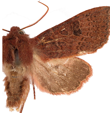
Fig. 12: Orthosia transparens .