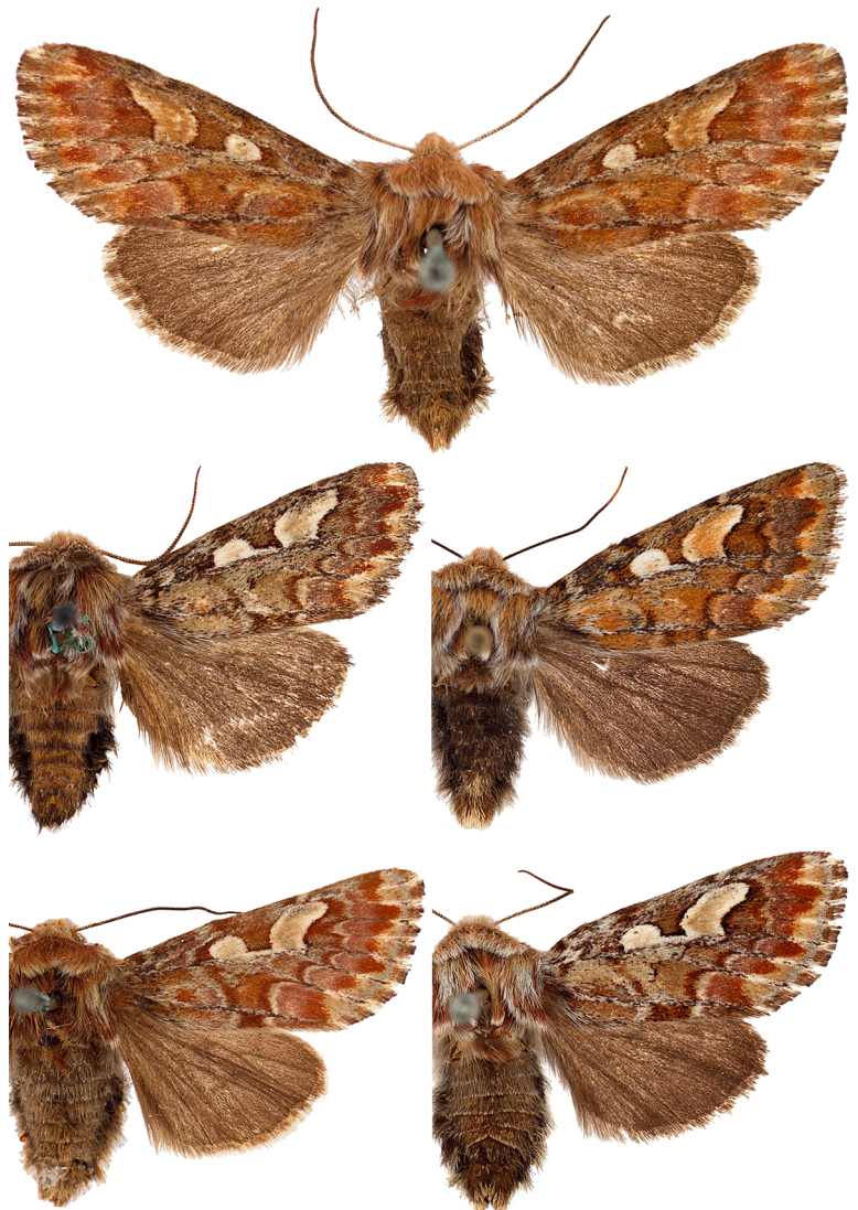
Fig. 4: Variation in wing pattern and coloration of P. flammea adults (top two rows = males; bottom row = females).