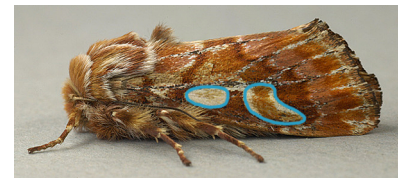
Fig. 6: Typical forewing markings (outlined in blue) for P. flammea (resting specimen - lateral view) (Photo by Malcolm Storey, Discover Life).