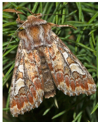
Fig. 2: Panolis flammea resting (Photo by Olaf Leillinger).

CAPS Approved Trapping Method: Plastic bucket trap