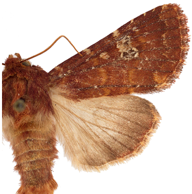
Fig. 17: Sideridis congemana .