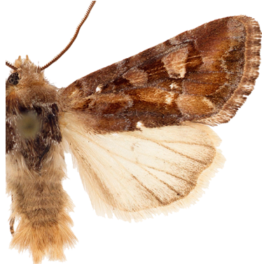
Fig. 18: Lacinipolia lepidula .