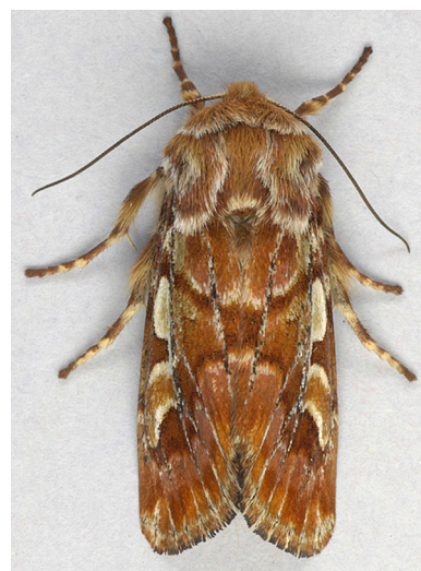
Fig. 1: Panolis flammea resting (Photo by Malcolm Storey, Discover Life).

This aid is designed to assist in the sorting and screening P. flammea suspect adults collected from CAPS bucket traps in the continental United States. It covers basic sorting of traps and first level screening, all based on morphological characters. Basic knowledge of Lepidoptera morphology is necessary to screen for P. flammea suspects.