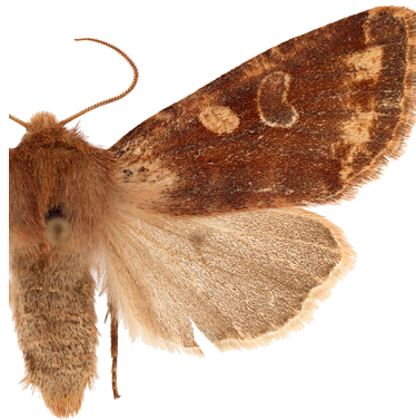
Fig. 9: Orthosia rubescens .