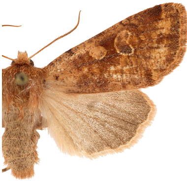
Fig. 8: Orthosia rubescens .