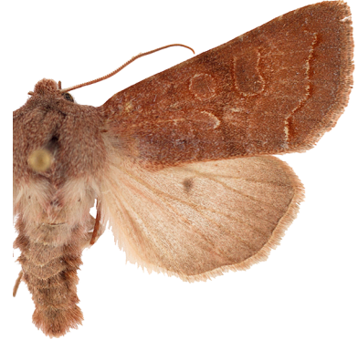
Fig. 16: Orthosia revicta .