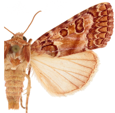
Fig. 19: Hexorthodes hueco .