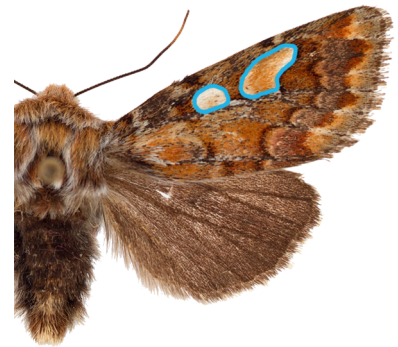
Fig. 5: Typical forewing markings (outlined in blue) for P. flammea (spread specimen).

A sampling of North American non-targets is displayed on Page 4. Non-targets expected to be encountered in P. flammea pheromone traps include other Hadenini as well as Orthosia (Orthosiini). Note that the species on Page 4 have not been verified to be attracted to P. flammea traps and that non-targets encountered during CAPS surveys will vary by region.