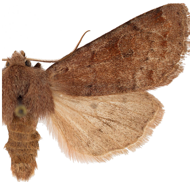
Fig. 14: Orthosia alurina .