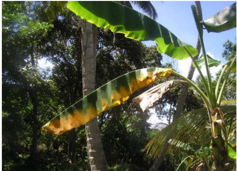
Figure 5. Banana leaf showing signs of infestation by the red palm mite, Trinidad, 2006.

Raoiella indica poses a significant threat to the United States' banana, coconut, and palm industries (USDA, 2007). NAPPO (2007) states that this mite is considered a direct threat to both the ornamental palm and coconut industries found in Alabama, Arizona, California, Florida, Hawaii, Puerto Rico, and Texas. Although most information available on R. indica deals with its relationship with Cocos nucifera (coconut), it could also have potentially negative effects on other hosts present in the New World. Its recent find in Florida could affect the Florida palm industry which has $200 million in annual sales and represents 7% of total Florida nursery sales (FDACS, 2009).