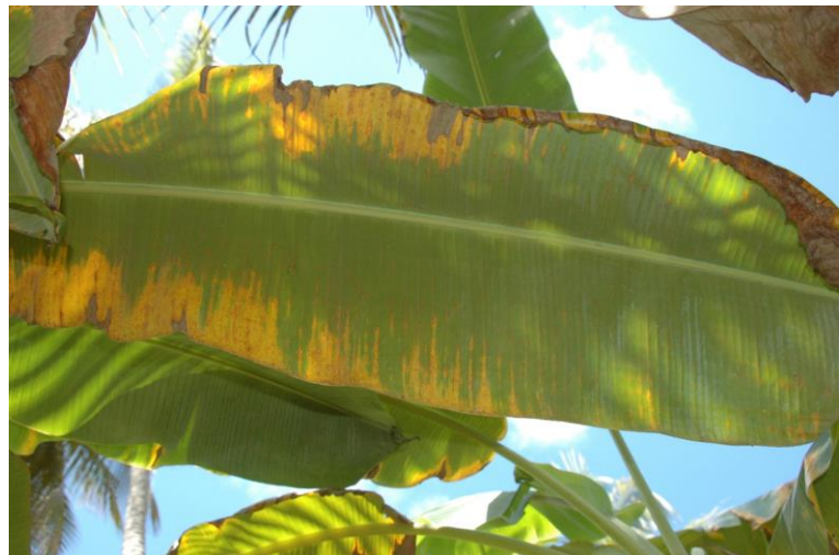
Figure 6. The discolored areas on the underside of this banana leaf are where red palm mites have caused damage to the plant.