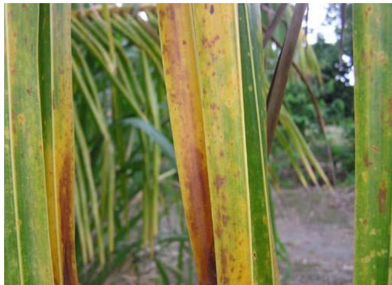
Figure 4. Detail of chlorosis and necrosis on coconut fronds, Dominica, 2005 (J.E. Peña, University of Florida).