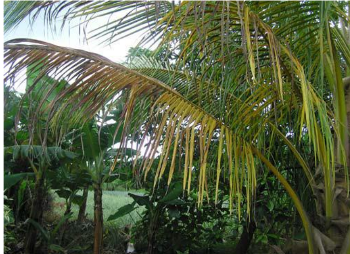
Figure 3. Chlorosis and necrosis of pinnae (leaflets) appears to be more pronounced on basal fronds of coconut palms on the island of Dominica (J.E. Peña, University of Florida).

Raoiella indica causes serious leaf damage which ruins the ornamental value of host material (Pons and Bliss, 2007). This species is considered a significant pest in Egypt, Mauritius, and the Philippines (Pons and Bliss, 2007) specifically on coconut (André Moutia, 1958). Since its discovery in the New World, this species has become a major concern to both the coconut and banana industries (Taylor et al., 2011).