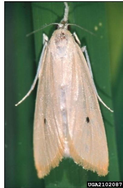
Figure 3. Chilo suppressalis adult.

Adult male: Forewing straw colored, variably or often uniformly suffused with light brown, with brown to dark-brown specks scattered irregularly, sometimes forming small patches; sometimes with broken, diffuse, oblique brown median band between middle of wing and apex; outer margin with row of small dark spots; fringe not metallic, of a lighter shade distally. Hindwing whitish, faintly shaded with brown; fringe uniformly whitish. Front of head conical, strongly protruding forward beyond eye, with very distinct corneous point and a protruding ridge along lower margin; front between point and ventral margin appears concave in profile. These features made visible by brushing away scales from face between the eyes. Labial palp 3 times as long as diameter of eye. Wing expanse ranges from 20-30 mm. Male genitalia bifurcate juxta symmetrical, the arms bowed, equally long, distinctively swollen, and without subapical teeth; aedeagus with long, thin, ventral arm (USDA, 1988).