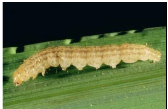
Figure 2. Chilo suppressalis larva.