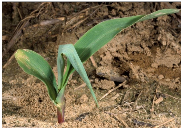
Figure 4. Dead heart symptom.

A pheromone dispenser (Selibate CS™) has been developed for both the monitoring and control of C. suppressalis in Spain. Studies to control the cost of using pheromone disruption by streamlining the density and placement within and around rice fields are in their fourth year (Alfaro et al.,