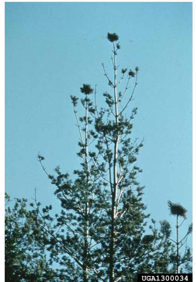
Crown damage on pine trees caused by Tomicus piniperda . The thinning of the crown is due to fallen terminals.

T. piniperda has also been found to vector bluestain fungi that are native to North America, including Ophiostoma ips , O. nigrocarpa , O. piceae , Leptographium terebrantis , and L. procerum (Haack and Lawrence, 1997).