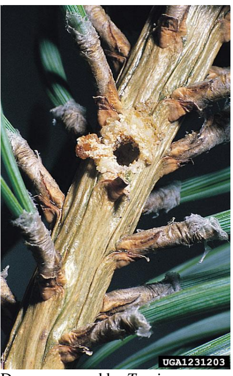
Damage caused by Tomicus piniperda.