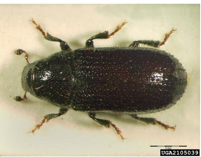
Dorsal view of adult Tomicus piniperda.

"Larvae are legless, slightly curved, have a white body and brown head, and can reach 1/4 inch (5 mm) in length when fully grown" (Haack and Kucera, 1993).