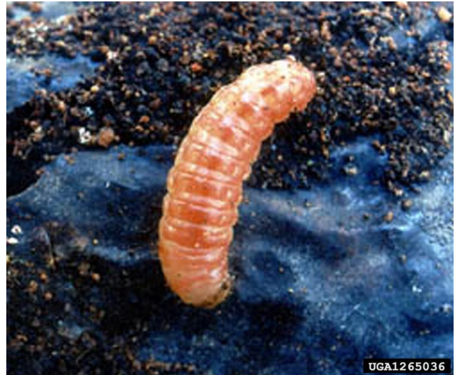
Figure 1. Larva of Thaumatotibia leucotreta.

Diagnostic characters would include the anal comb with two to ten teeth in addition to: L pinaculum on T1 enlarged and extending beneath and beyond (posterad of) the spiracle; spiracle on A8 displaced posterad of SD pinaculum; crochets unevenly triordinal, 36-42; L-group on A9 usually trisetose (all setae usually on same pinaculum) (Brown, 2011).