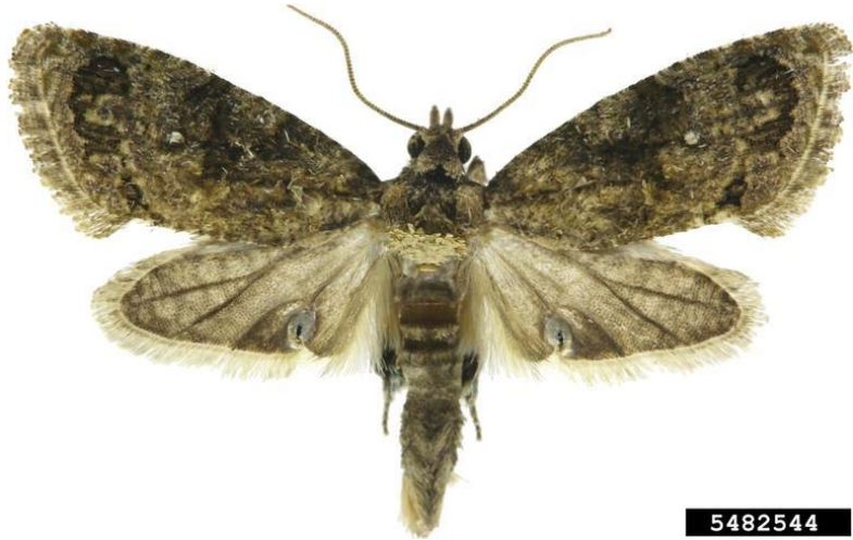
Figure 2. Thaumatotibia leucotreta adult male.

Adults: Adults are grayish brown to dark brown with an average forewing length of 7 to 8 mm (approx. \frac{5}{16} to in) for males and 9 to 10 mm (approx. \frac{3}{8} in) for females. Adult body length 6 to 8 mm (approx. \frac{1}{4} to \frac{5}{16} in), wingspan of female and male moth is 15 to 20 mm (approx. \frac{9}{16} to \frac{13}{16} in) and 15 to 18 mm (approx. \frac{9}{16} to \frac{11}{16} in), respectively. The body is brown; the thorax has a posterior double crest. The male forewing is triangular, with an acute