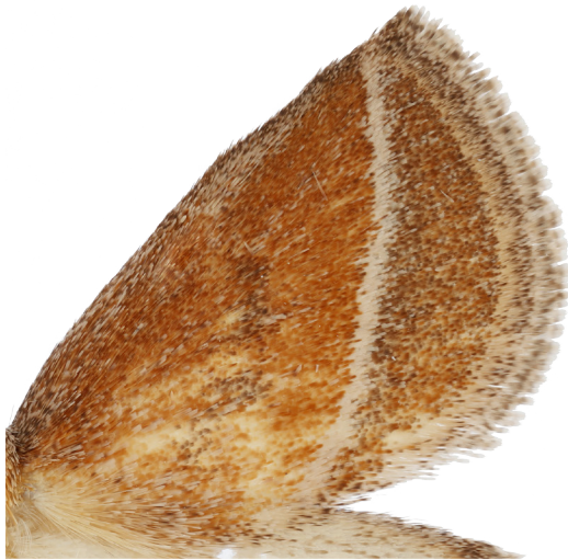
Fig. 9. Darna pallivitta

The distinguishing feature of the forewings is the white or light-colored line that runs from the apex to the inner margin (Fig. 9). The basal half of the divided wing is rusty brown while the distal half is a duller brown color. Close comparison of forewings of other limacodids is important for identification as markings are similar. Apoda rectilinea (Fig. 11) also has a white line dividing the wing but this runs from the costa to the inner margin rather than starting at the apex as in D. pallivitta (Fig. 9). Other species have forewings with more than one line or more uniform coloring (Figs. 10 & 12).