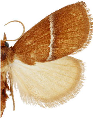
Fig. 16. Apoda rectilinea