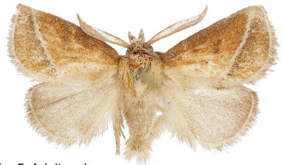
Fig. 5. Adult male