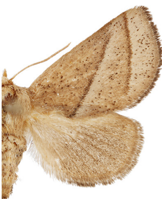
Fig. 19. Natada nasoni