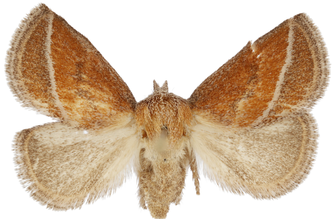
Fig. 6. Adult female

(Wing patterns of adult D. pallivitta are consistent between individuals and sex)