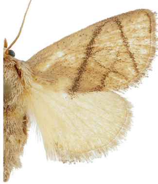
Fig. 14. Apoda y-inversa