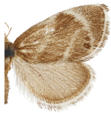
Fig. 18. Packardia elegans