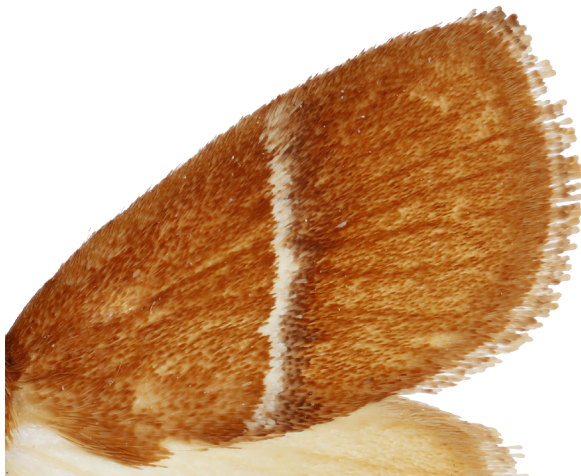
Fig. 11. Apoda rectilinea