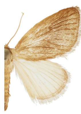
Fig. 19. Tortricidia testacea

Figures 13-21 represent a variety of North American limacodid species that have similar forewing patterns or that might be encountered during D. pallivitta surveys. Non-targets will vary by region and these species have not been confirmed to be attracted to D. pallivitta pheromone lures.