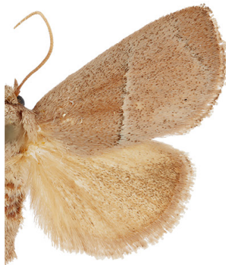
Fig. 17. Apoda rectilinea