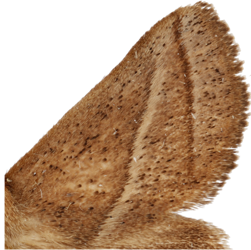
Fig. 10. Natada nasoni