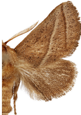
Fig. 20. Natada nasoni