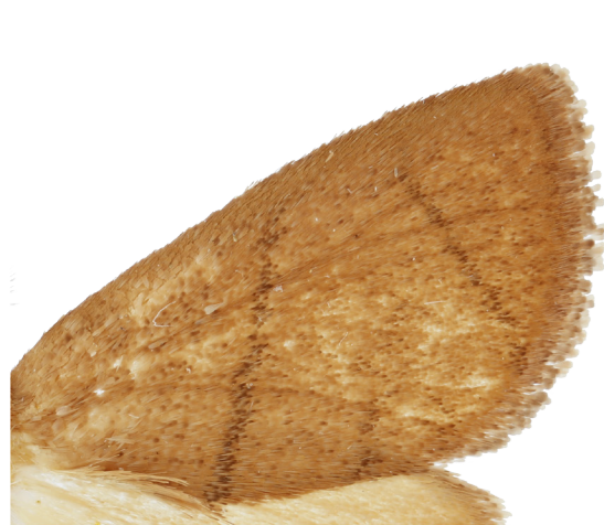
Fig. 12. Apoda y-inversa