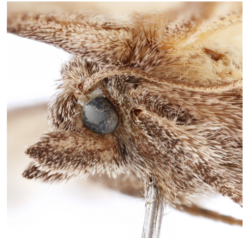
Fig. 7. Lateral view of densely-scaled head and forward-facing correct labial palpi (note that males will have bipectinate antennae, not shown here).

Moths meeting the above criteria should be moved to Level 2 Screening (Page 4). Traps to be forwarded to another facility for Level 2 Screening should be carefully packed following the steps outlined in Fig. 8. Traps should be folded, with glue on the inside, making sure the two halves are not touching, secured loosely with a rubber band or a few small pieces of tape. Plastic bags can be used unless the traps have been in the field a long time or contain large numbers of possibly rotten insects. Insert 2-3 styrofoam packing peanuts on trap surfaces without moths to cushion and prevent the two sticky surfaces from sticking during shipment to taxonomists. DO NOT simply fold traps flat or cover traps with transparent plastic wrap (or other material), as this will guarantee specimens will be seriously damaged or pulled apart – making identification difficult or impossible.