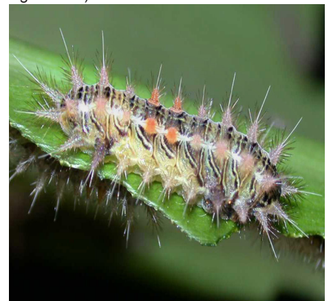
Fig. 2. Lorsal view of late instar larva.