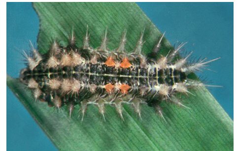
Fig. 1. Dorsal view of late instar larva with characteristic 4 orange spines.

This aid is designed to assist in the sorting and screening D. pallivitta suspect adults collected from CAPS pheromone traps in the continental United States. It covers basic sorting of traps and first and second level screening, all based on morphological characters. Basic knowledge of Lepidoptera morphology is necessary to screen for D. pallivitta suspects.