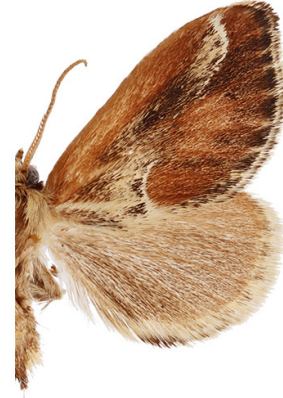
Fig. 15. Adoneta spinuloides