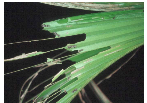
Fig. 3. Larval damage on palm frond.