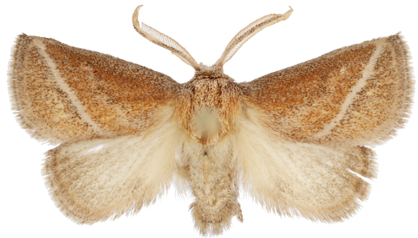
Fig. 4. Adult male