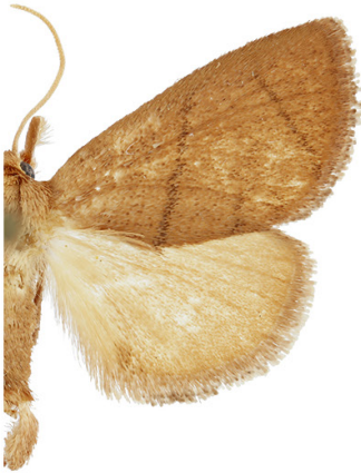
Fig. 13. Apoda y-inversa