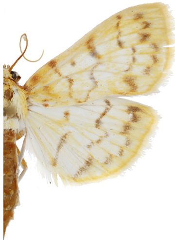
Fig. 9: Polygrammodes flavidalis