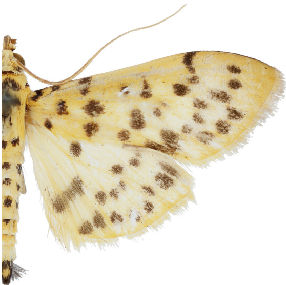
Fig. 8: C. punctiferalis

North American non-targets that are most likely to be confused with C. punctiferalis (Fig. 8) are other yellow-colored moths within the subfamily Spilomelinae. These include several species in the genus Polygrammodes and Phaedropsis stictigrama . Two species, Polygrammodes flavidalis and P. oxydalis (both eastern U.S.), are similar in color but have indistinct dashes rather than dark wing spots as in C. punctiferalis (Figs. 9-10). Polygrammodes elevata (southern Florida) has wing spots similar to that of C. punctiferalis , but these are generally smaller and purple in color (Fig. 11). Phaedropsis stictigrama (central to southern Florida) lacks black spotting on the abdominal segments although white bands are present on some segments; males have dark scales on abdominal segment 8, similar to C. punctiferalis . However, wings of P. stictigrama are deeper yellow, more sparsely spotted, and have a black outer margin that is not present in C. punctiferalis (Fig. 12).