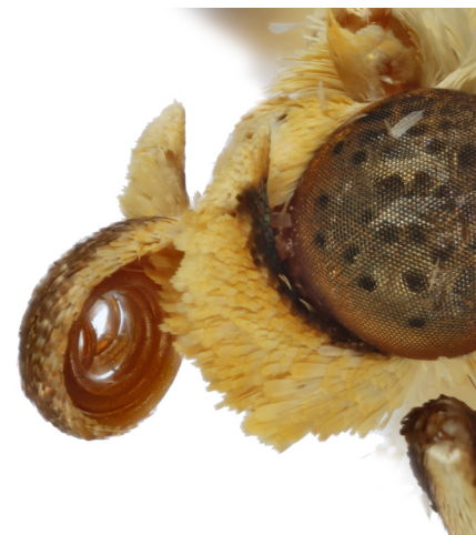
Fig. 6: Head of Conogethes punctiferalis showing scaled proboscis and upturned labial palpi.

Moths meeting the above criteria should be moved to Level 2 Screening (Page 4). Traps to be forwarded to another facility for Level 2 Screening should be carefully packed following the steps outlined in Fig. 7. Traps should be folded, with glue on the inside, making sure the two halves are not touching, secured loosely with a rubber band, and placed in a plastic bag for shipment. Insert 2-3 styrofoam packing peanuts on trap surfaces without moths to cushion and prevent the two sticky surfaces from sticking during shipment to taxonomists. DO NOT simply fold traps flat or cover traps with transparent plastic wrap (or other material), as this will guarantee specimens will be seriously damaged or pulled apart – making identification difficult or impossible.