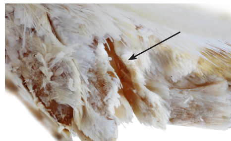
Fig. 5: Tympanum present at abdominal base of all Pyraloidea.