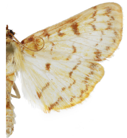
Fig. 10: Polygrammodes oxydalis