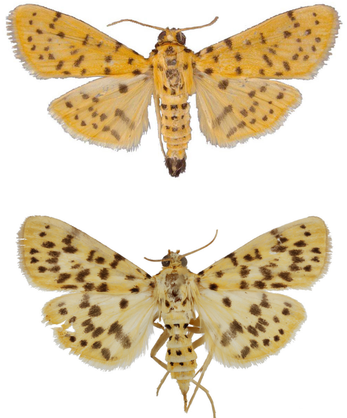
Fig. 4: Wing pattern and coloration of C. punctiferalis male (top) and female (bottom). Males have black scales on the 8th abdominal segment (Top photo by Christi Jaeger, MEM).