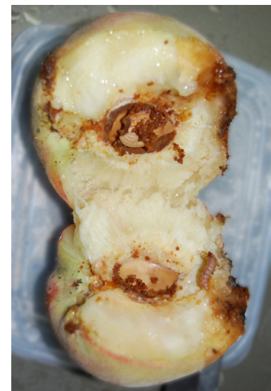
Fig. 2: Larval damage in peach.

Conogethes punctiferalis is a member of the Crambidae (Spilominae), a large group of moths formally placed in the Pyralidae that contains many pests. This species belongs to a complex that contains an unknown number of species that are very similar morphologically and have larvae that cause significant economic damage to a number of hosts. Adults have a forewing length of 9-15 mm with both fore- and hindwings colored pale straw yellow and marked with numerous black spots. Rows of black spots are present on the first four abdominal segments and males have black scales on abdominal segment 8. The yellow peach moth is somewhat similar in appearance to other yellow-colored moths within the subfamily Spilomelinae. Final identification requires dissection of adult male genitalic structures.