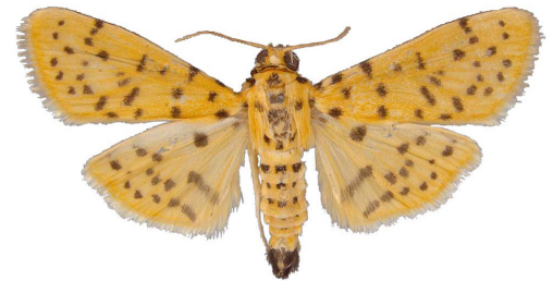
Fig. 1: Conogethes punctiferalis male.

The yellow peach moth, Conogethes punctiferalis (Guenée), belongs to a complex of species native to India, Southeast Asia, and Australia. Larvae are highly polyphagous and feed on fruits in a wide variety of families. Intense feeding on fruits can render them unfit for commercial sale leading to economic losses. Recorded major hosts include, but are not limited to, peach ( Prunus persica ), cacao ( Theobroma cacao ), guava ( Psidium guajava ), durian ( Durio zibethinus ), pomegranate ( Punica granatum ), maize ( Zea mays ), apple ( Malus ssp. ), onion ( Allium cepa ), castor ( Ricinus communis ), and cardamom ( Elettaria cardamomum ). Boring by larvae can cause extensive damage and frass accumulation, but may also predispose fruits to secondary pathogens, adding to crop loss. Although not present in the continental U.S., there are records of this complex from Hawaii.