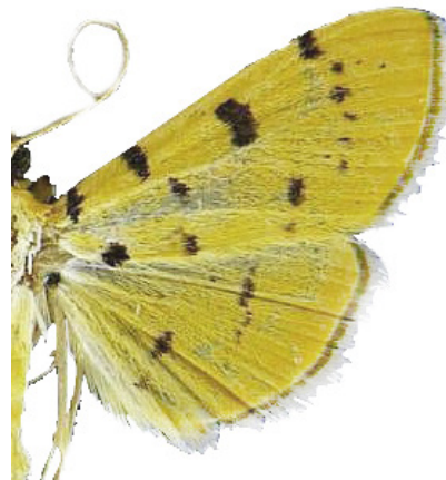
Fig. 12: Phaedropsis stictigrama