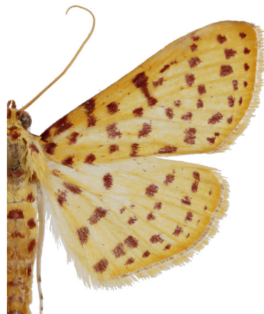
Fig. 11: Polygrammodes elevata