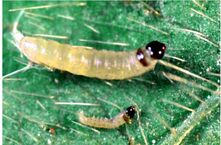
Figure 2. First (bottom) and third (top) instar Crociosema aporema .

In addition to the leaf-rolls, infested plants exhibit stunted growth (Fig. 5), increased secondary branching, and premature flower bud and pod drop (Bentancourt and Scatoni, 2006)