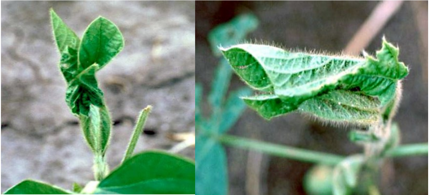
Figure 4. Leaf-rolls created by Crocidosema aporema larvae.