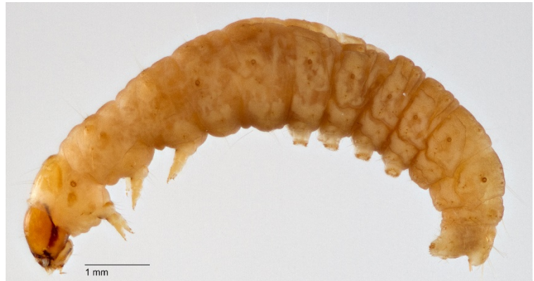
Figure 3. Late instar larva of Crociosema aporema .