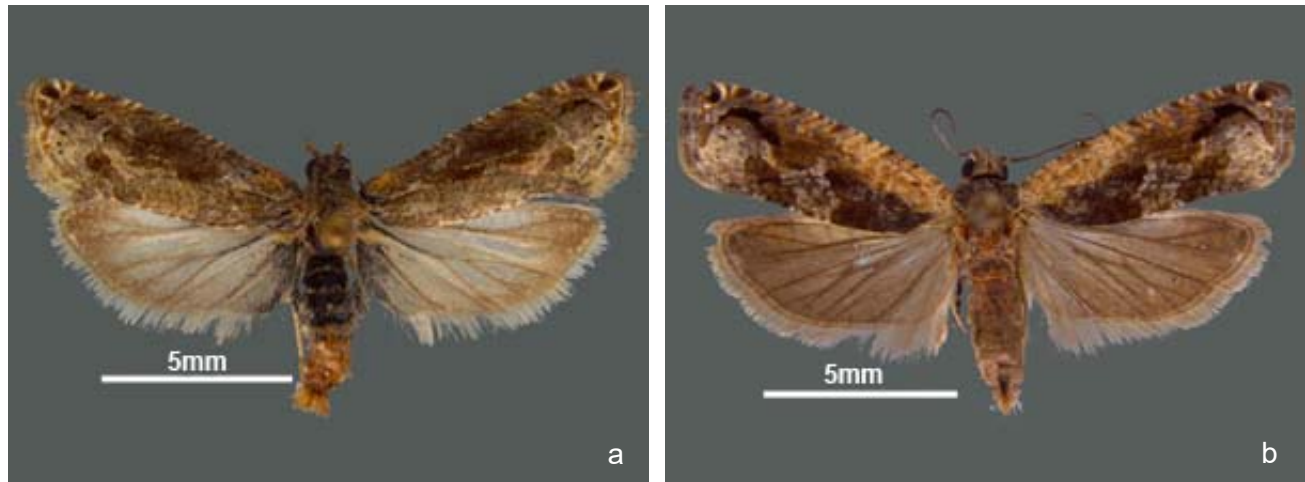
Figure 1. Adult (a) male and (b) female Crociosema aporema .