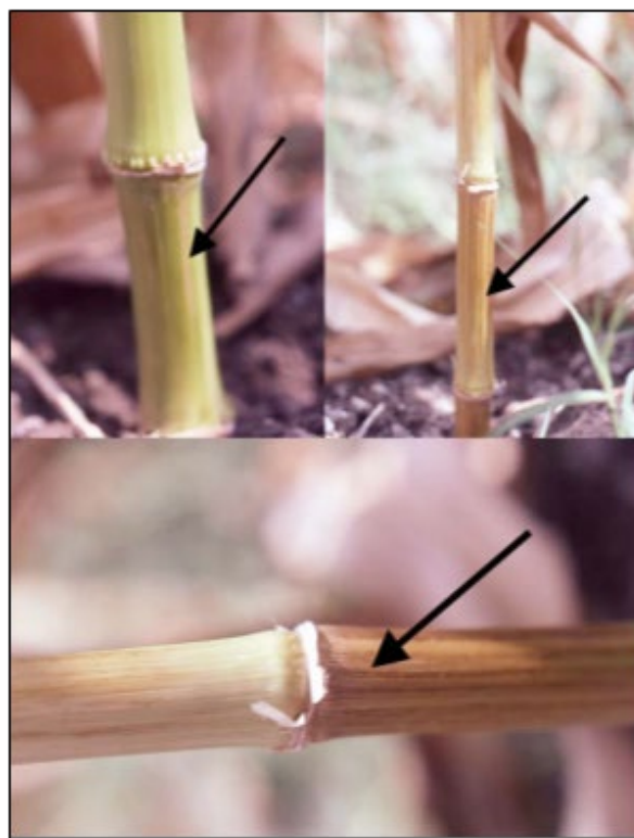
Figure 3: Progressive development of yellow to reddish-brown streaks caused by M. maydis on infected lower cornstalks.