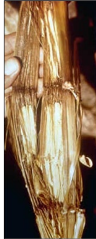
Figure 4. Dry hollow M. maydis infected corn stalk.

Late wilt thrives in rough-textured soil where the environment is hot and humid (Khokhar et al., 2014; Samra and Sabet, 1966; Singh and Siradhana, 1987a). The minimum temperature for growth of M. maydis is 54°F, the optimum temperature is 77–86°F, and the maximum temperature is 86°F. Low soil moisture (25% saturation) is favorable for M. maydis survival, and high soil moisture (100% saturation) adversely affects the pathogen (Dawood et al., 1979; Khokhar et al., 2014). A slightly acidic soil of pH 6.5 contributes to the highest degree of disease incidence (Singh and Siradhana, 1987a).