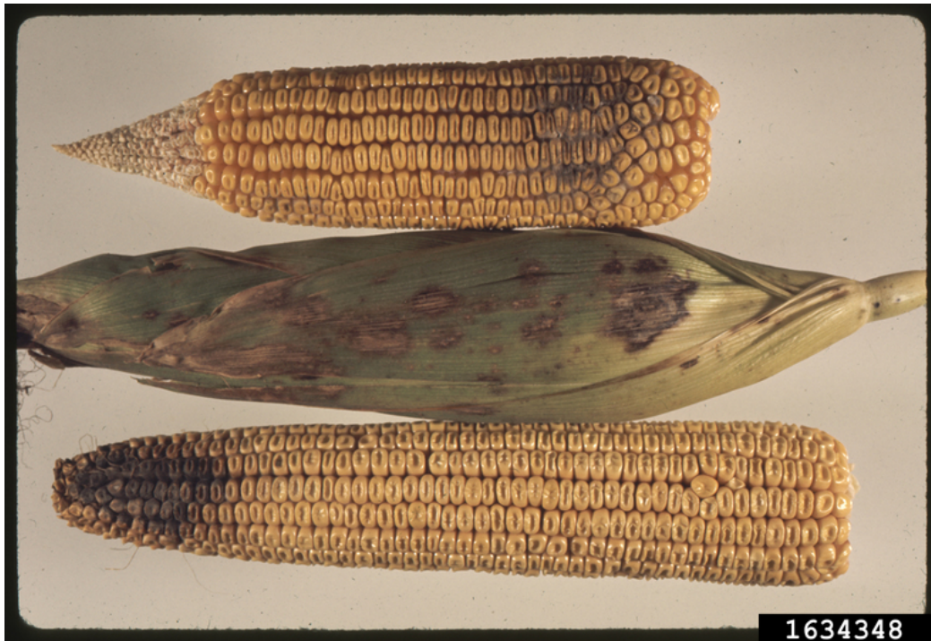
Figure 5: Magnaporthiopsis maydis infection on corn.

Magnaporthiopsis maydis can infect and colonize kernels, causing rot of seeds and seedlings in severe infections (Fig. 5) (Jain et al., 1974; White, 1999). The fungus can survive in corn seed for up to 10 months (Singh and Siradhana, 1987), although specific conditions, such as host cultivar, can affect seed transmission rates (Michail et al., 1999).