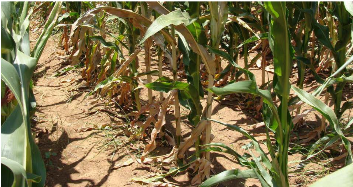
Figure 1. Late wilt diseased field symptoms: drying out ascends upwards in the plant, including leaf yellowing and dehydration, and color alteration of the lower stem and internode. Wilted Jubilee cv. plants photographed in the southern area (No. 10) of a maize field in Kibbutz Naot Mordechai in the Hula Valley (Upper Galilee, northern Israel) 75 d after sowing (28/6/08, 15 days after fertilization). Photo and caption courtesy of Degani and Cernica, (2014)

Class: Sordariomycetes Order: Magnaporthales Family: Magnaporthaceae