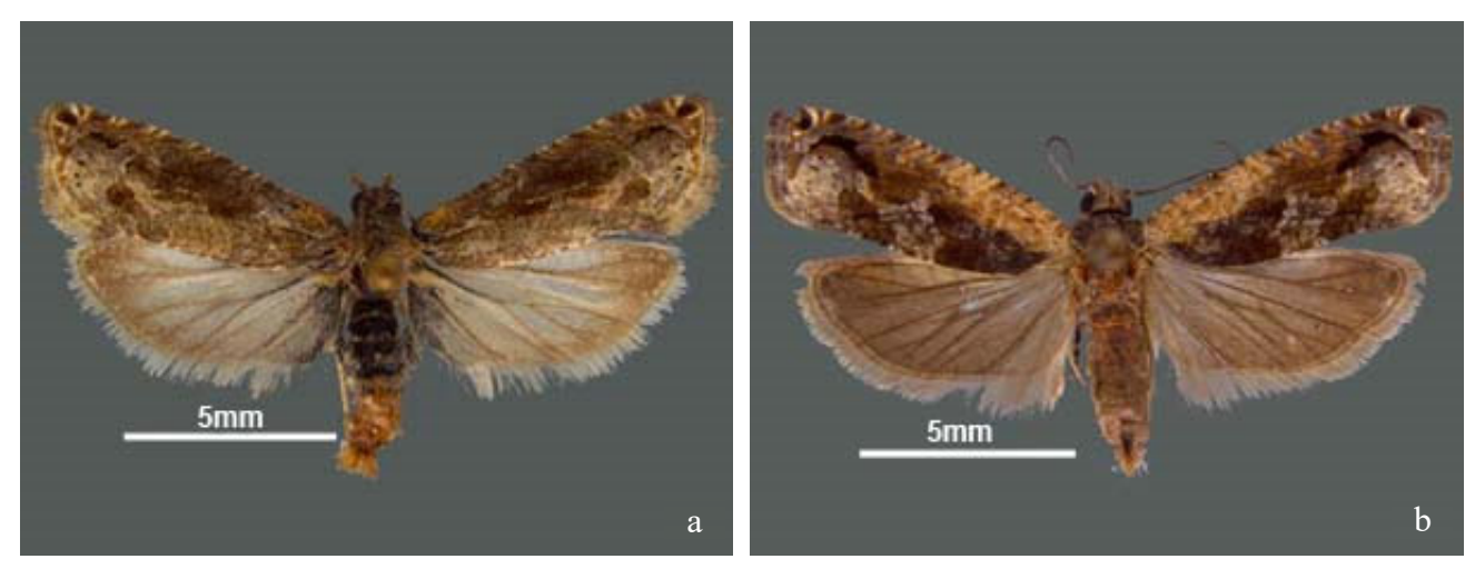
Figure 1. Adult (a) male and (b) female Crocidosema aporema.