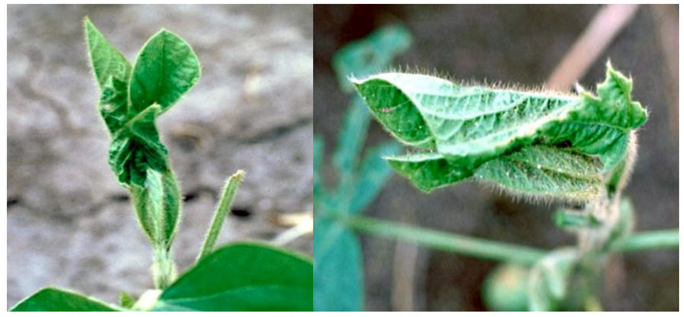
Figure 5. Leaf-rolls created by Crocidosema aporema larvae.