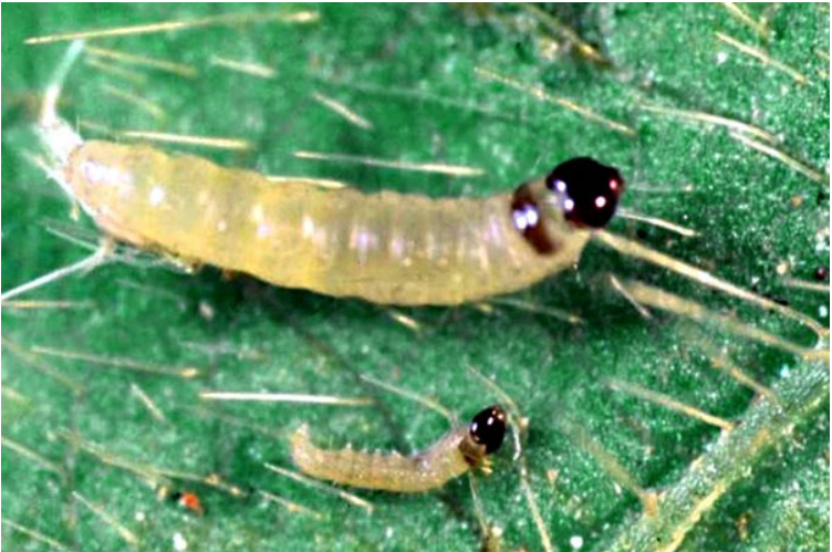
Figure 2. First (bottom) and third (top) instar Crocidosema aporema . Photo: Laboratório de Controle Integrado de Insetos (<u>http://www.bio.ufpr.br/portal/insectbiocontrol/</u>).

Adult moths are small and brown. The adult wingspan is 14 to 17 mm (approx. 0.55 to 0.67 in) wide (Morey, 1972; Ferreira, 1980) (Figs. 1a and b). Adults are nocturnal (Liljesthröm et al., 2001). During the day, adults rest within the vegetation, but flush and fly in short bursts if disturbed (Cano Ortiz, 1998; Wille, 1952). Daytime observations of adults are unlikely.