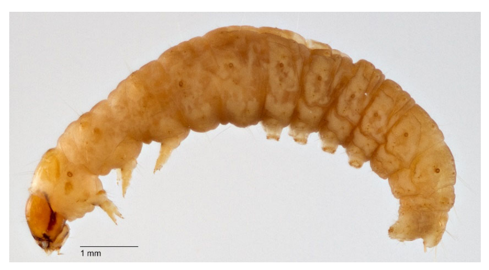
Figure 3. Late instar larva of Crocidosema aporema .

to yellowish green. The head capsule is shiny and black in early instars (1-3) (Fig. 2). In later instars (4-5), the head is reddish brown with a lateral black dash on each side (Fig. 3). Fully grown larvae are approximately 10 mm (0.39 in) long (Morey, 1972).