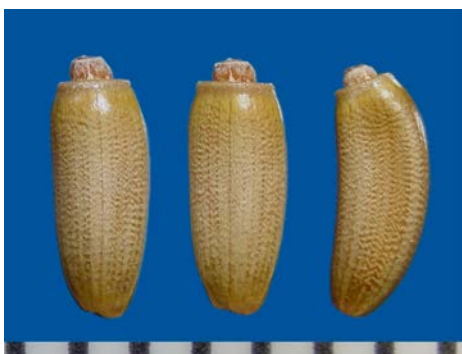
Carduus nutans L. Musk thistle; Nodding thistle

Fruits oblong to obovate, compressed, slightly gibbous, 2.5-3.8 mm long; glabrous, +/- glossy, light brown to gray-brown with numerous brown longitudinal lines, surface appearing pebbled; apical rim light-colored to same color as fruit body, horizontal to slightly oblique, margin smooth; style base constricted to cone-shaped (elaiosome); pappus white, of many basally fused, minutely barbed bristles, deciduous as a ring; scar basal.