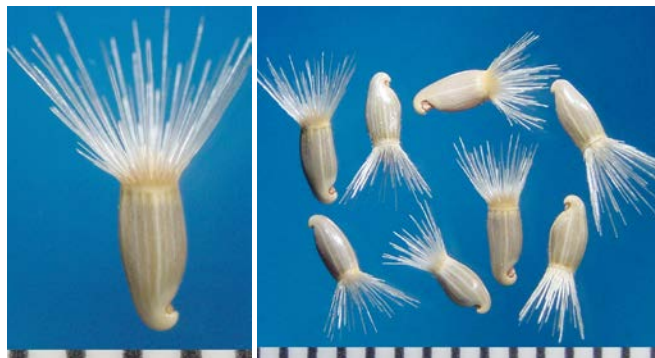
Centaurea melitensis L.

Fruits oblong to obovate, compressed, 5.5-8 mm long; smooth, glabrous, dull to lustrous, brown with a few tan-colored longitudinal lines, area around scar tan; apical rim horizontal, margin crenulate to denticulate; pappus of several progressively longer whorls of flattened, divergent, minutely barbed bristles and a convergent inner row of short bristles partially concealing the long style base, brown, persistent, 5-8 mm long; scar in \pm hook-shaped lateral depression; elaiosome \pm present at scar.