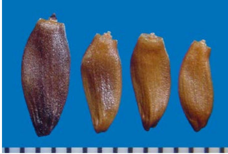
Cirsium ochrocentrum A. Gray Yellowspine thistle

Fruits oblong to obovate, compressed, \pm gibbous, 6-9 mm long; smooth, glabrous, lustrous, golden-brown to orange-brown; apical rim only slightly lighter in color than body of fruit, oblique; style base cylindrical to lobed (elaiosome); pappus of many basally fused, plumose bristles, tan, deciduous as a ring, 20-30 mm long; scar basal.