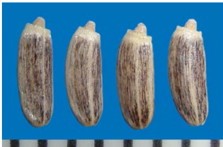
Cirsium vulgare (Savi) Ten. Bull thistle

Fruits oblong to obovate, compressed, \pm gibbous, 6-7 mm long; smooth, glabrous, lustrous, light gray to light brown with purple or black longitudinal streaking; apical rim light-colored, oblique; style base cylindrical to lobed (elaiosome); pappus of many basally fused, plumose bristles, creamy white, deciduous as a ring, 20-40 mm long; scar basal.