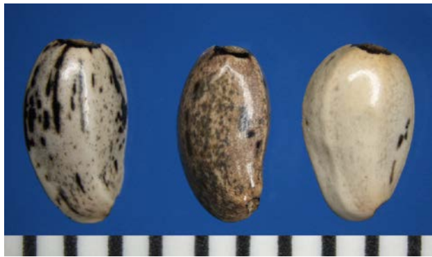
Carthamus oxycantha M. Bieb. Wild safflower

Fruits dimorphic, both forms obpyramidal, the four ridges forming sharp points near the apex, margins between ridge points dentate, 3-5 mm long; scar lateral, along ridge. Epappose fruits: dark brown, strongly wrinkled. Pappose fruits: smooth and light brown near base, wrinkled towards apex, ± dark-colored near apex; pappus of several whorls of progressively longer, narrow, scabrous, chaffy scales (tips of longest scales mostly blunt or toothed), 5-7 mm long, persistent.