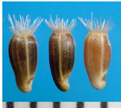
Centaurea diffusa Lam. Diffuse knapweed

Fruits oblong, compressed, 4-5 mm long; smooth, glossy, sparsely pubescent, blue-gray with various amounts of light-colored longitudinal lines, area around scar yellow; apical rim white to yellow, horizontal, margin mostly smooth; pappus of dense, minutely barbed, narrow scales, brush-like, uneven, erect, tan to reddish-brown, persistent, 2-4 mm long; scar laterally-oblique, opening ca. 1/3 the length of the fruit; elaiosome present at scar.