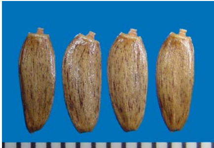
Cirsium undulatum (Nutt.) Spreng. Wavyleaf thistle

Fruits oblong to obovate, compressed, \pm gibbous, 6-9 mm long; smooth, glabrous, lustrous, golden-brown to orange-brown; apical rim only slightly lighter in color than body of fruit, oblique; style base cylindrical to lobed (elaiosome); pappus of many basally fused, plumose bristles, tan, deciduous as a ring, 20-30 mm long; scar basal.