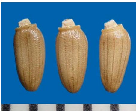
Carduus acanthoides L. Plumeless thistle

Fruits narrowly oblong to oblanceolate, slightly compressed, 3.5-5 mm long; smooth, dull, pubescent; dark brown to pale in color with numerous light-colored longitudinal lines; apical rim tan to brown, horizontal, margin crenulate to denticulate; pappus of several whorls of narrow, chaffy scales, each whorl progressively longer, 1/3 to nearly equal to fruit length, tan-colored, persistent; style base exposed; scar surrounded by a light-colored, thick, raised rim, +/- heart-shaped; elaiosome present at scar.