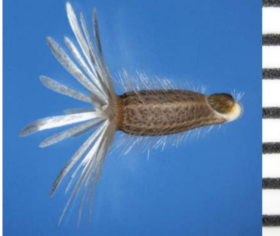
Volutaria tubuliflora (Mirb.) Sennen Desert knapweed

Fruits +/- slightly obovate, weakly compressed, (3.2)3.5-3.8(4.2) mm long, with several light-colored longitudinal ribs, inter-rib areas darker-colored, surface pitted, pubescent; apical rim horizontal, margin dentate; pappus of 3-4 widely divergent whorls of distinct chaffy scales, (2.8)3-4(4.4) mm long, outer whorls shorter and narrower than longer and broader inner whorls, white, persistent; style base exposed, ca. 0.5 mm long, 5-ribbed; scar lateral, surrounded by light-colored rim thickened near base; large elaiosome present at scar.