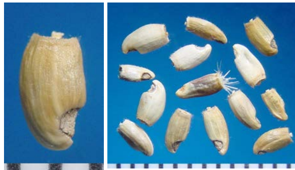
Centaurea jacea L. sensu lato

Fruits oblong to obovate, compressed, 3-4 mm long; smooth, glossy, glabrous, tan with dark-colored mottling and streaking, tan around scar area; apical rim light-colored, horizontal, margin \pm smooth; pappus of several progressively longer whorls of divergent, minutely barbed, flattened bristles and narrow scales and a convergent inner row of short bristles partially concealing the style base, white, persistent, 1-3 mm long; scar in hook-shaped lateral depression; elaiosome mostly none.