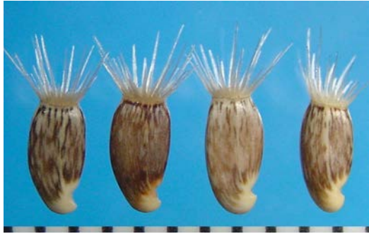
Centaurea iberica Trevir. ex Spreng. s.l. Iberian starthistle

Fruits oblong to obovate, compressed, 3-4 mm long; smooth, glossy, glabrous, tan with dark-colored mottling and streaking, tan around scar area; apical rim light-colored, horizontal, margin \pm smooth; pappus of several progressively longer whorls of divergent, minutely barbed, flattened bristles and narrow scales and a convergent inner row of short bristles partially concealing the style base, white, persistent, 1-3 mm long; scar in hook-shaped lateral depression; elaiosome mostly none.