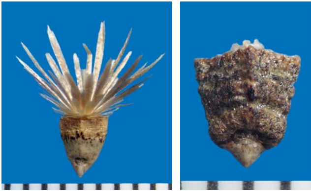
Carthamus leucocaulos Sm. Whitestem distaff thistle

Fruits dimorphic, both forms obpyramidal, the four ridges forming sharp points near the apex, margins between ridge points dentate, 3-5 mm long; scar lateral, along ridge. Epappose fruits: dark brown, strongly wrinkled. Pappose fruits: smooth and light brown near base, wrinkled towards apex, ± dark-colored near apex; pappus of several whorls of progressively longer, narrow, scabrous, chaffy scales (tips of longest scales mostly blunt or toothed), 5-7 mm long, persistent.