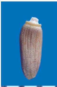
Carduus crispus L. Wetted thistle; Curly plumeless thistle

Fruits oblong to obovate, compressed, slightly gibbous, 2.5-3.8 mm long; glabrous, +/- glossy, light brown to gray-brown with numerous brown longitudinal lines, surface appearing pebbled; apical rim light-colored to same color as fruit body, horizontal to slightly oblique, margin smooth; style base constricted to cone-shaped (elaiosome); pappus white, of many basally fused, minutely barbed bristles, deciduous as a ring; scar basal.