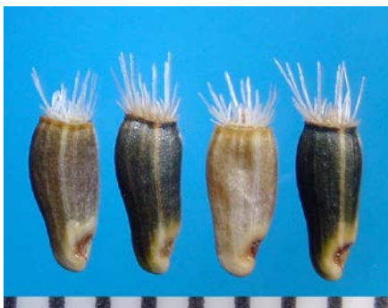
Centaurea stoebe L. subsp. australis (Pancic ex A. Kern.) Greuter [ C. stoebe L. subsp. micranthos (Gugler) Hayek; C. maculosa auct. Amer.] Spotted knapweed

Fruits dimorphic, oblong to obovate, compressed, 2-3 mm long. Epappose fruits: smooth, glabrous, dull, dark brown to black with light mottling; apical rim light-colored, margin smooth; style base inconspicuous; scar lateral, slightly notched, elaiosome none, epappose. Pappose fruits: smooth, glossy, glabrous, white to pale yellow with various amounts of dark mottling; apical rim horizontal, light-colored, margin \pm smooth; pappus of 3-4 whorls of progressively longer divergent, minutely barbed, flattened bristles and convergent inner whorl of short bristles concealing the style base, white, persistent, 2-4 mm long; scar lateral, slightly notched; elaiosome none.