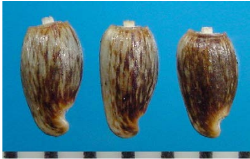
Centaurea calcitrapa L. Purple starthistle

Fruits oblong to obovate, compressed, 2.5-3.5 mm long; smooth, typically glabrous, dull to lustrous, white to light gray with various amounts of brown mottling to longitudinal streaking; apical rim \pm light-colored, horizontal, margin smooth; style base cylindrical to lobed; scar in lateral, \pm hook-shaped depression; epappose; elaiosome none.