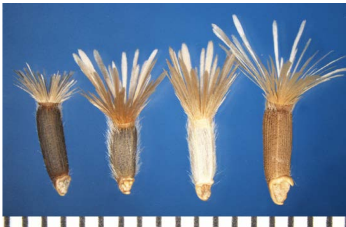
Amberboa moschata (L.) DC. [ Centaurea imperialis hort.; C. moschata L.] Sweet sultan

Fruits narrowly oblong to oblanceolate, slightly compressed, 3.5-5 mm long; smooth, dull, pubescent; dark brown to pale in color with numerous light-colored longitudinal lines; apical rim tan to brown, horizontal, margin crenulate to denticulate; pappus of several whorls of narrow, chaffy scales, each whorl progressively longer, 1/3 to nearly equal to fruit length, tan-colored, persistent; style base exposed; scar surrounded by a light-colored, thick, raised rim, +/- heart-shaped; elaiosome present at scar.