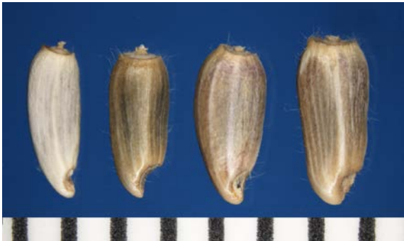
Centaurea nigrescens Willd. Vochin knapweed

Fruits oblong to obovate, compressed, 2.5-3 mm long; smooth, dull to \pm lustrous, finely pubescent, tan to gray with longitudinal light-colored lines; apical rim dark-colored, horizontal, margin crenulate to denticulate; pappus none or of few to many unequal, narrow, minutely barbed scales, persistent, 0.5-1 mm long; scar in large \pm hook-shaped lateral depression; elaiosome \pm present at scar.