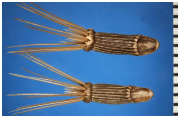
Centaurea benedicta (L.) L. [ Cnicus benedictus L.] Blessed thistle

Fruits white, dull to glossy; with four longitudinal ridges usually forming four bumps near the apex, 7-9 mm long; scar lateral, along ridge, slightly depressed; style deciduous, style base round; pappus of several rows of narrow scales, deciduous.