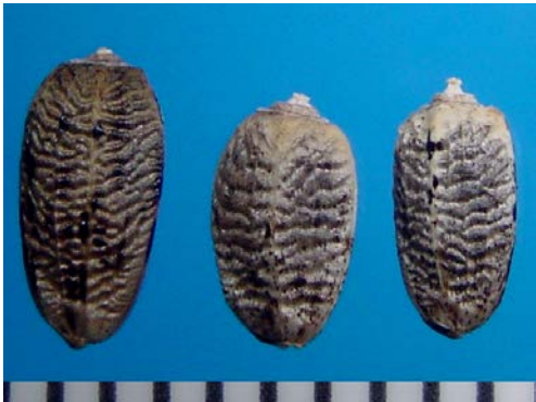
Onopordum tauricum Willd. Taurian thistle

Fruits oblong to obovate, compressed, four-sided, 4-6 mm long; glabrous, dull, slightly transversely wrinkled, grayish-tan to grayish-brown with various amounts of purplish-black streak, spots or mottling; apex with slightly depressed ring around style base; pappus of many basally fused, plumose bristles, creamy-white, 10-12 mm long, deciduous as a ring; scar basal or nearly so; elaiosome ± present, lance-shaped, attached at or near scar.