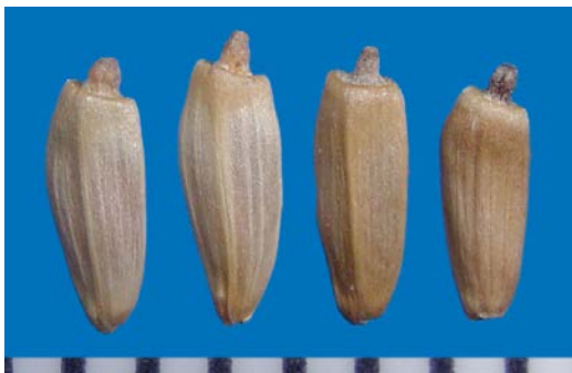
Cirsium japonicum Fisch. ex DC. Japanese thistle

Fruits oblong to obovate, \pm gibbous, obscurely 4-angled towards base, \pm slightly curved, 2-4 mm long; slightly constricted below apical rim; smooth, dull to lustrous; gray, yellow or golden-brown, darker towards base, some with longitudinal striping; apical rim golden, slightly oblique; style base cylindrical, sometimes with a small knob on top; pappus of many basally fused, plumose bristles, dusty white, deciduous as a ring, 13-32 mm long; scar basal.