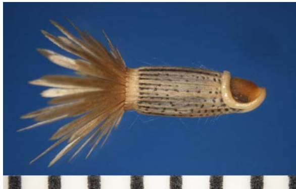
Volutaria muricata (L.) Maire Morocco knapweed

Fruits +/- slightly obovate, weakly compressed, (3.2)3.5-3.8(4.2) mm long, with several light-colored longitudinal ribs, inter-rib areas darker-colored, surface pitted, pubescent; apical rim horizontal, margin dentate; pappus of 3-4 widely divergent whorls of distinct chaffy scales, (2.8)3-4(4.4) mm long, outer whorls shorter and narrower than longer and broader inner whorls, white, persistent; style base exposed, ca. 0.5 mm long, 5-ribbed; scar lateral, surrounded by light-colored rim thickened near base; large elaiosome present at scar.