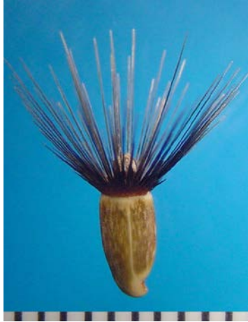
Centaurea sulphurea Willd. Sicilian starthistle

Fruits oblong to oval, compressed, 5-8 mm long; smooth, glabrous, glossy, yellow base color with dark greenish-brown streaking, usually with one or two light longitudinal lines on each side, scar area yellow; apical rim yellow, horizontal, \pm crenulate; pappus of several whorls of progressively longer divergent, minutely barbed, narrow scales and flattened bristles, inner whorl of short narrow scales concealing the style base, black, persistent, 6-7 mm long; scar lateral, in hook-shaped depression; elaiosome none.