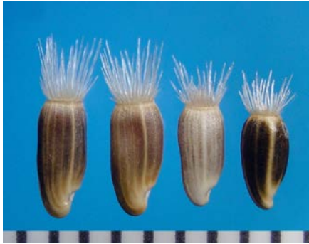
Centaurea virgata Lam. subsp. squarrosa (Boiss.) Gugler [ C. squarrosa Willd., non Roth] Squarrose knapweed

Fruits oblong to oval, compressed, 5-8 mm long; smooth, glabrous, glossy, yellow base color with dark greenish-brown streaking, usually with one or two light longitudinal lines on each side, scar area yellow; apical rim yellow, horizontal, \pm crenulate; pappus of several whorls of progressively longer divergent, minutely barbed, narrow scales and flattened bristles, inner whorl of short narrow scales concealing the style base, black, persistent, 6-7 mm long; scar lateral, in hook-shaped depression; elaiosome none.