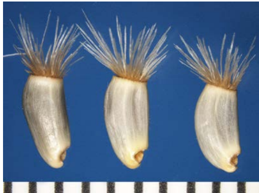
Centaurea cineraria L. Dusty miller

Fruits oblong to obovate, compressed, 2.5-3.5 mm long; smooth, typically glabrous, dull to lustrous, white to light gray with various amounts of brown mottling to longitudinal streaking; apical rim \pm light-colored, horizontal, margin smooth; style base cylindrical to lobed; scar in lateral, \pm hook-shaped depression; epappose; elaiosome none.