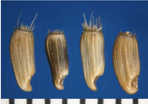
Centaurea nigra L. black knapweed

Fruits oblong to obovate, compressed, 2.5-3 mm long; smooth, dull to \pm lustrous, finely pubescent, tan to gray with longitudinal light-colored lines; apical rim dark-colored, horizontal, margin crenulate to denticulate; pappus none or of few to many unequal, narrow, minutely barbed scales, persistent, 0.5-1 mm long; scar in large \pm hook-shaped lateral depression; elaiosome \pm present at scar.