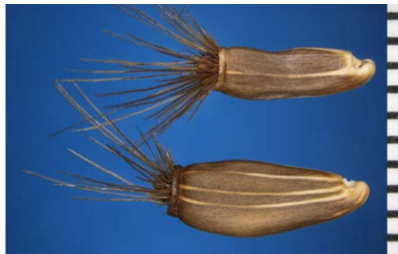
Centaurea macrocephala Muss. Puschk. ex Willd. big-head knapweed

Fruits oblong to obovate, compressed, 2.5-3 mm long; smooth, dull to lustrous, \pm finely hairy, tan to light gray; apical rim horizontal, margin smooth to crenulate; epappose or of few to many short, minutely barbed bristles, white, persistent, 0.5-1 mm long; style base exposed; scar in \pm hook-shaped lateral depression, elaiosome present at scar.