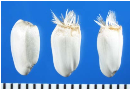
Carthamus tinctorius L. Safflower

Fruits oblong to obovate, elliptic to weakly 4-sided in cross-section, 3-5.5 mm long; smooth, glabrous, glossy, creamy white with brownish-black mottling and steaking; fruit apex without raised rim, area surrounding style base round and rough, style base deciduous; epappose; scar oblique, in shallow notch.