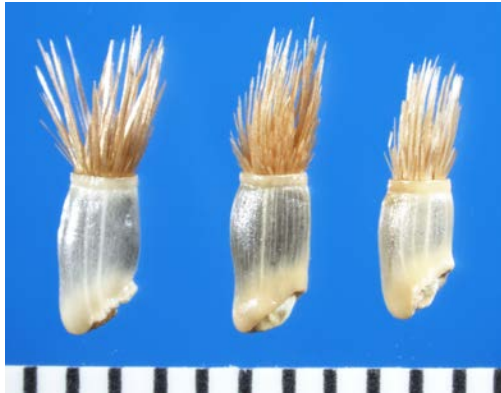
Centaurea cyanus L. Bachelor's-button; Cornflower; Ragged robin

Fruits oblong, \pm curved, compressed, \pm 3.5 mm long; smooth, glossy, sparsely pubescent, blue-gray with various amounts of light-colored longitudinal lines, area around scar yellowish; apical rim white to yellow, horizontal to slightly oblique, margin crenulate; pappus of 1-2 whorls of divergent, minutely barbed flattened bristles and convergent inner row of short, bristles partially concealing the style base, white, persistent, 0.5-2.5 mm long; scar lateral; elaiosome present at scar.