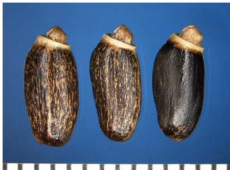
Silybum marianum (L.) Gaertn. [ Cardus marianus L.] Milk thistle; Blessed milk thistle

Fruits broadly oval to obovate, compressed, 2-4 mm long; smooth, dull, longitudinally ridged, ivory, occasionally green or yellow tinged; apex with slightly depressed ring around style base; scar basal or oblique; pappus of many flattened bristles, white, deciduous, 6-8 mm long; elaiosome lacking.