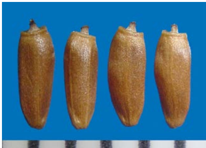
Cirsium arvense (L.) Scop. Canada thistle

Fruits oblong, compressed, 2.5-3.5 mm long; smooth, dull to lustrous, glabrous, grayish-tan to light or dark brown with light-colored longitudinal lines, area around scar \pm light-colored; apical rim light-colored, horizontal, margin smooth; pappus of several whorls of progressively longer, minutely barbed, narrow scales and flattened bristles and convergent inner whorl of short bristles concealing the style base, white, persistent, 1-2.5 mm long; scar in lateral slightly hook-shaped depression; elaiosome \pm present at scar.