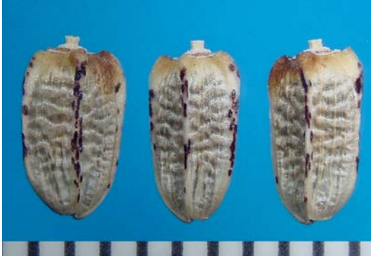
Onopordum illyricum L. Illyrian thistle

Fruits oblong to obovate, compressed, four-sided, 4-6 mm long; glabrous, dull, slightly transversely wrinkled, grayish-tan to grayish-brown with various amounts of purplish-black streak, spots or mottling; apex with slightly depressed ring around style base; pappus of many basally fused, plumose bristles, creamy-white, 10-12 mm long, deciduous as a ring; scar basal or nearly so; elaiosome ± present, lance-shaped, attached at or near scar.