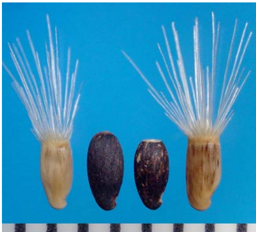
Centaurea solstitialis L. sensu lato Yellow starthistle

Fruits oblong to obovate, compressed, 3-3.5 mm long; smooth, dull to \pm lustrous, finely pubescent, tan to gray with longitudinal light-colored lines; apical rim light-colored, horizontal, margin crenulate; pappus none or of many unequal, \pm deciduous bristles, 0.5-1 mm long; scar in large \pm hook-shaped lateral depression; elaiosome \pm present at scar.