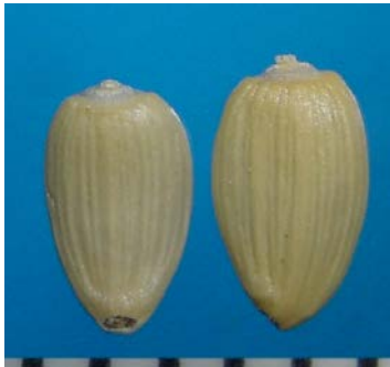
Rhaponticum repens (L.) Hidalgo [ Acroptilon repens (L.) DC, Centaurea repens L., C. picris Pall. ex Willd.] Russian knapweed

Fruits oblong to obovate, compressed, slightly four-sided, 5-6 mm long; dull, transversely wrinkled, grayish brown with various amounts of black streaking; apex with slightly depressed ring around style base; pappus of many scabrous to minutely barbed bristles, whitish to tan, 8-10 mm long, deciduous as a ring; scar basal or nearly so; elaiosome ± present, lance-shaped, attached at or near scar.