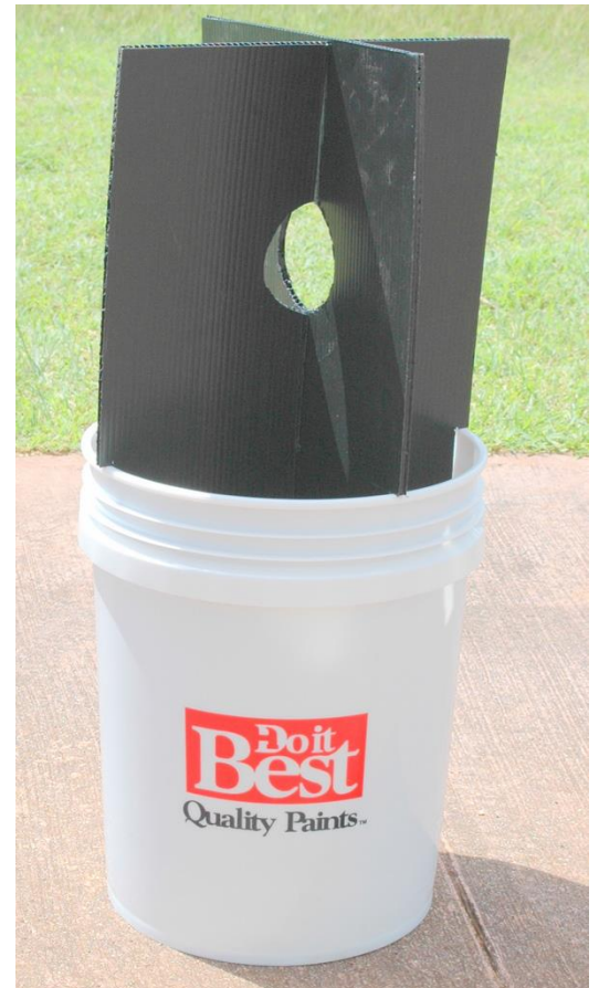
Figure 11. Vaned bucket trap