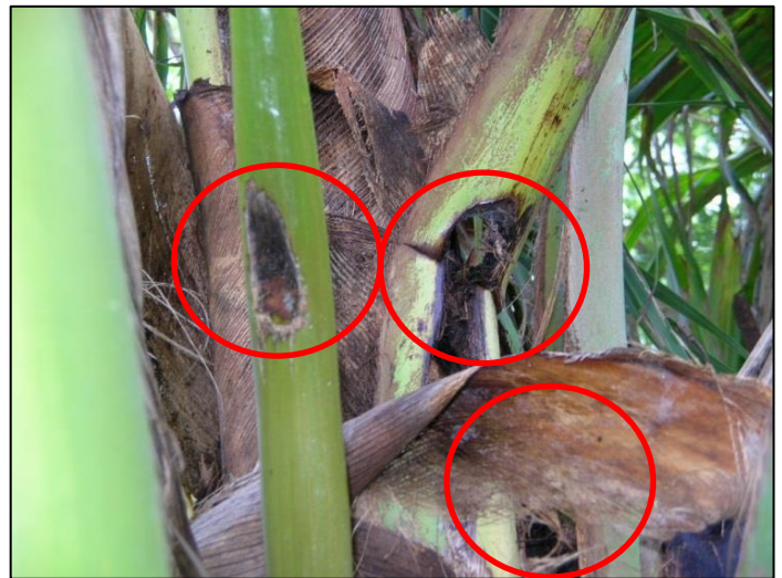
Figure 9. Adult feeding hole (Ben Quicocho, Guam).