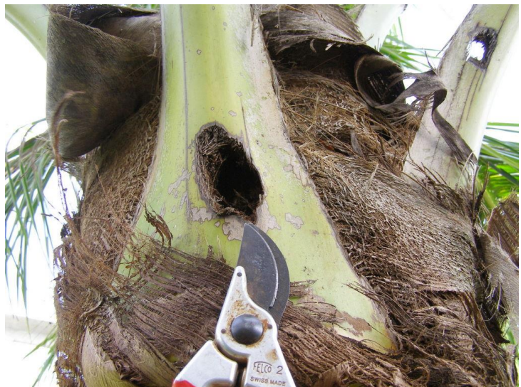
Figure 6. Feeding damage caused by Oryctes rhinoceros (Ernie Nelson, Greenscapes Inc, Guam).