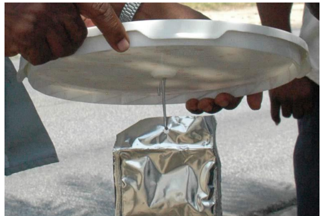
Figure 14. Lid of homemade bucket trap with hanging lure.

For surveys in the urban environment, traps should be suspended from trees or poles.