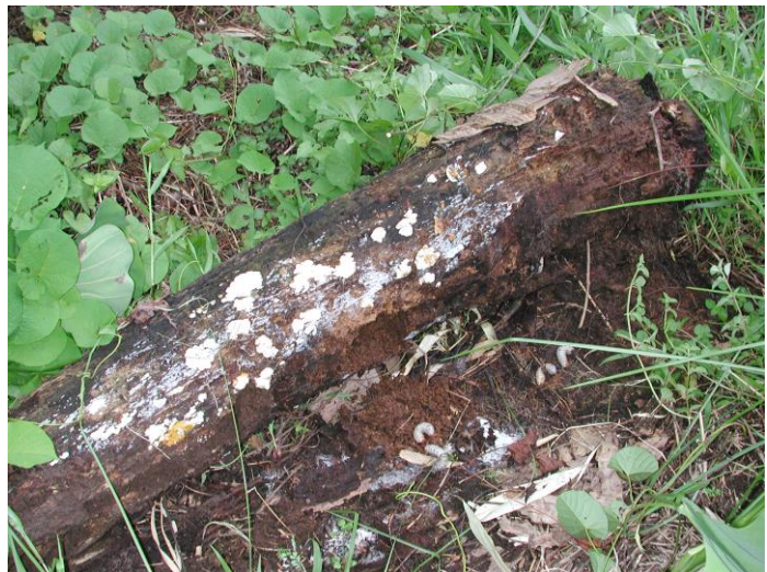
Figure 4. Breeding site of Oryctes rhinoceros under a coconut log.

Adults mate several times in dead or dying plant material (Catley, 1969), including decaying palm trunks (Zelazny and Alfiler, 1987). The females make a serpentine burrow in which they lay their eggs. According to Hinckley (1973), females can oviposit in “almost any log or heap soft enough for burrowing, yet firm enough to provide compacted frass”. Females lay between 3 and 4 clutches of eggs with about 30 eggs per clutch (Hinckley, 1973), laying between 70 and 140 eggs total