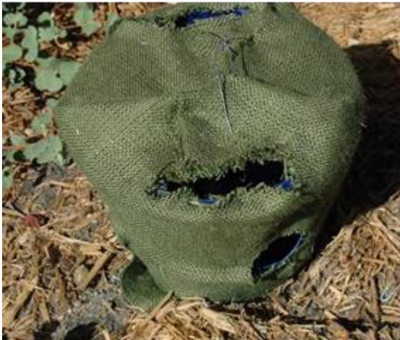
Figure 12. Homemade bucket trap covered with burlap.