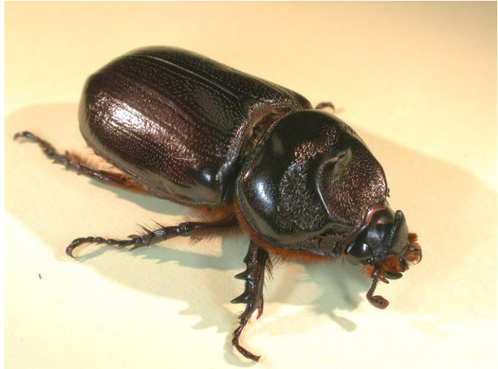
Figure 1. Oryctes rhinoceros female (Mark Schmaedick, American Samoa Community College).

Larvae: Newly hatched larvae are 7.5 mm long (approx. \frac{5}{16} in) (Lever, 1979). "The large (60 to 105 mm long [approx. 2\frac{3}{8} to 4\frac{1}{8} in]) white mature larva is C-shaped, with a brown head capsule and legs. The posterior part of the abdomen is a bluish-grey colour" (Giblin-Davis, 2001). Larval instars are