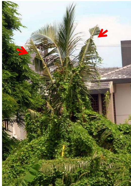
Figure 5. Palm damage caused by O. rhinoceros adults (Ben Quichocho, USDA-APHIS, Guam).

There is a positive correlation between abundance of larval food and damage by adults to palms. Outbreaks can be