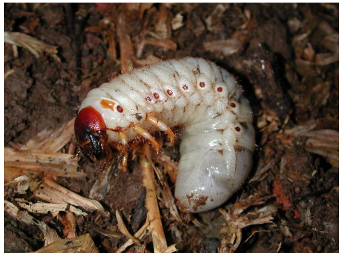
Figure 3. Larva of Oryctes rhinoceros (Mark Schmaedick, American Samoa Community College).