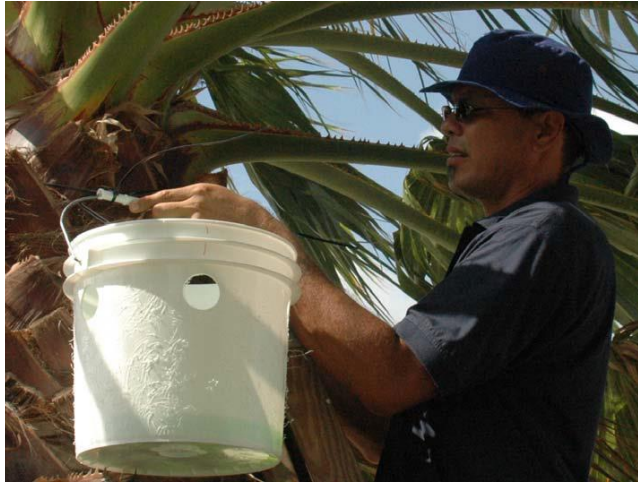
Figure 13. Homemade bucket trap with entrance holes.