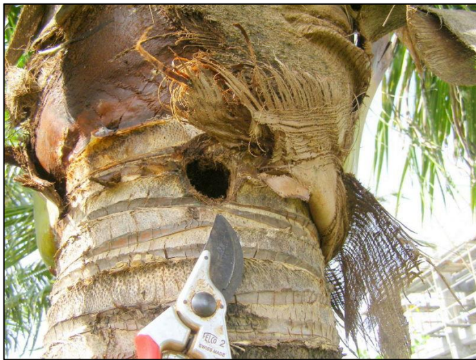
Figure 8. Feeding damage caused by CRB.

IMPORTANT: Permission must be obtained by the property owner before performing any destructive sampling of the palms. This should not be considered unless the palm is highly suspect (shows obvious damage or is dying).