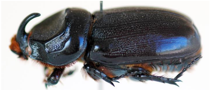
Figure 2. Oryctes rhinoceros male (Aubrey Moore, University of Guam).