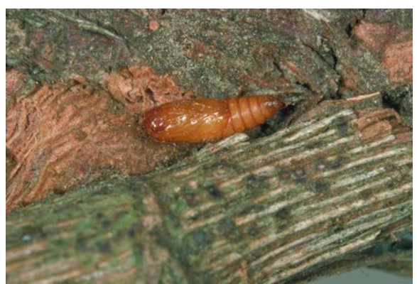
Figure 3. Eupoecilia ambiguella pupa.

"The forewing is yellow or yellowish orange with a well-defined dark-brown to black median fascia. Males and females exhibit no sexual dimorphism in wing pattern although females may be slightly larger than males. Males lack a forewing costal fold. Male genitalia are distinguished by a reduced uncus, short socii, prominent transtilla, distally triangular valva, and large aedeagus. Female genitalia are distinguished by a broad, short ductus burase and a corpus bursae with numerous sclerotizations and spines" (Gilligan and Epstein, 2012).