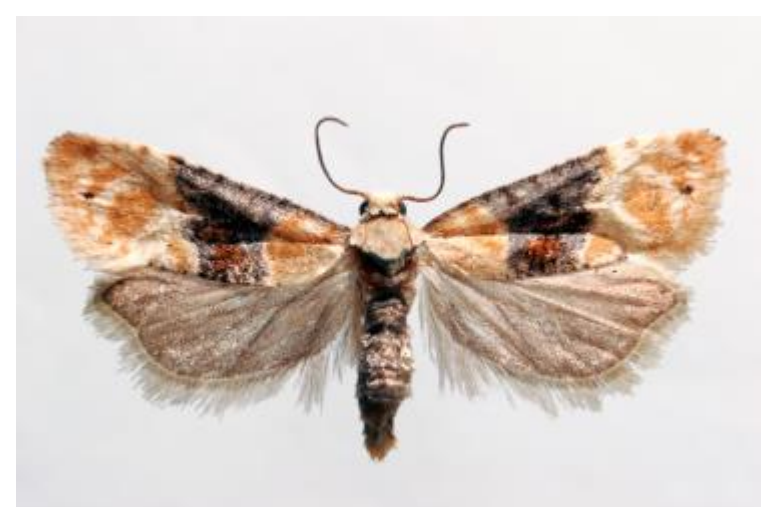
Figure 1. Eupoecilia ambiguella adult (V. V. Neimorovets).

European grape berry moth , grape berry moth, grape bud moth, vine moth, grape moth, grapevine moth