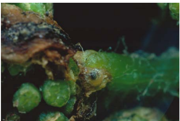
Figure 2. Eupoecilia ambiguella egg.

Larvae: "Late instar larvae are approximately 10-12 mm in length. The head, prothoracic shield, and legs are dark brown to black. Body color varies from brown to yellow and green. Pinacula are large, conspicuous, and brown. The anal shield is pale brown" (Gilligan and Epstein, 2012).