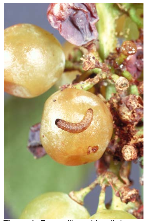
Figure 4. Eupoecilia ambiguella larva and damage (Rémi Coutin, OPIE).

Larval damage is similar to damage caused by Lobesia botrana . Flower buds, open flowers, and young fruitlets can be destroyed, as well as developing or mature grapes later on in the season (Alford, 2007). Tunnels and partly eaten seeds can be seen through the pulp of