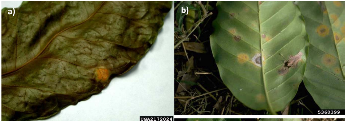
Figure 3. Coffee leaves showing symptoms of coffee rust infection caused by Hemileia vastatrix in the field. Note the white growth around an old lesion caused by the hyperparasite Lecanicillium lecanii (b).