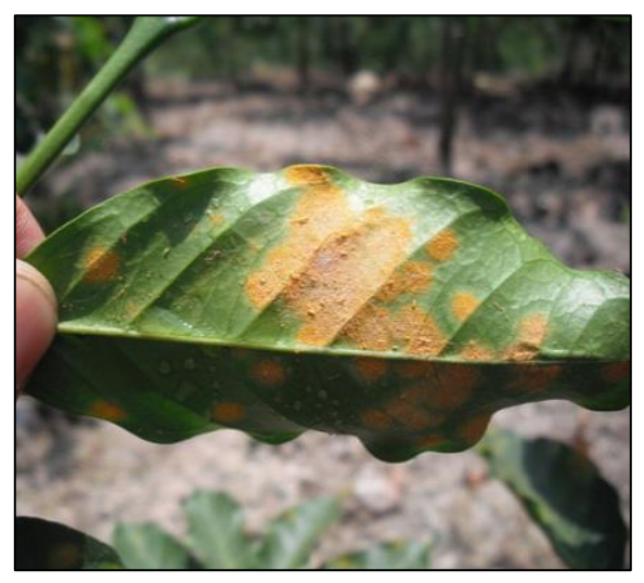
Figure 1 . Severe symptoms of Hemileia vastatrix in Rwanda. Courtesy of Smartse -Own work. Published under the <u>creative</u> <u>commons attributions license</u>.

Hemileia vastatrix (coffee leaf rust) was first reported in 1861 by a British explorer on uncultivated coffee in the Lake Victoria region of Kenya in East Africa. The fungus is thought to originate from this region. In cultivated coffee, it was reported from Ceylon (now Sri Lanka) in 1867 (USDA-ARS SBML 2005). The disease decimated coffee production in Ceylon within 10 years (Ferreira and Boley, 1991). By the 1920's H. vastatrix was widespread in commercial coffee plantations in Africa and Asia (Ferreira and Boley, 1991). Because of the impact of H. vastatrix , tea replaced coffee as the primary cash crop in many British colonies (Christensen, 2003). Hemileia vastatrix was thought to be eradicated from Papua New Guinea three different times until it was reported to be widespread there in 1965 (Ferreira and Boley, 1991). In 1970, the disease was discovered in the Western Hemisphere for the first time in Bahia, Brazil (USDA-ARS SBML, 2005). From there, it guickly spread to neighboring countries, and by 1986 was reported from: Argentina, Bolivia, Colombia, Costa Rica, Cuba, Ecuador, El Salvador, Guatemala, Honduras, Jamaica, Mexico, Nicaragua, Paraguay, Peru, and Venezuela (Ferreira and Boley, 1991). Currently, H. vastatrix is found in nearly every coffee growing region in the world, with the notable exception of Hawaii (Ferreira and Boley, 1991).