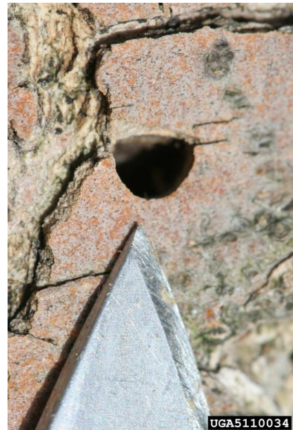
Exit hole caused by A. planipennis adult

If you have leftover lures from previous seasons (manuka and phoebe oil), please contact one of the following EAB representatives (listed in the Contact Information section below) for further instructions. For small amounts of lures you may be able to use the lures during this survey season; however, for large amounts of lures, the lures may need to be redirected to researchers.