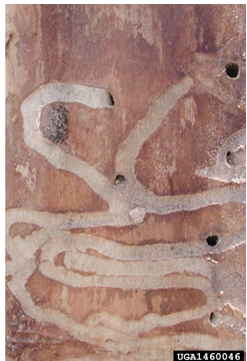
Galleries caused by A. planipennis larvae.