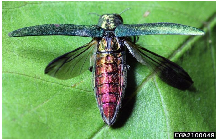
A. planipennis adult (Image courtesy of David Cappaert, Michigan State University, Bugwood.org).

“Pupae are 10 to 14 mm [approx. 3/8 to 9/16 in] long and are creamy white in color. The antennae stretch back to the base of the elytra and the last few segments of the abdomen bend slightly ventrad (Canadian Food Inspection Agency 2002, Haack et al. 2002)” (Ciesla, 2003).