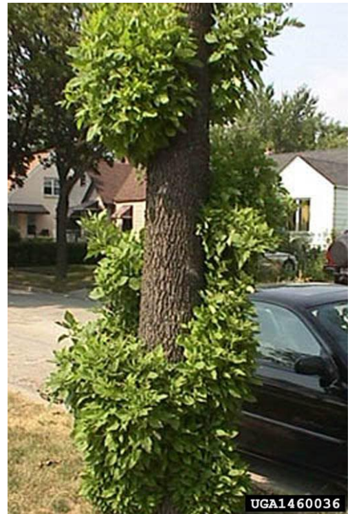
Tree with new shoot growth below attack site.

If bark is removed from infested trees, serpentine galleries can be observed. Galleries run along the