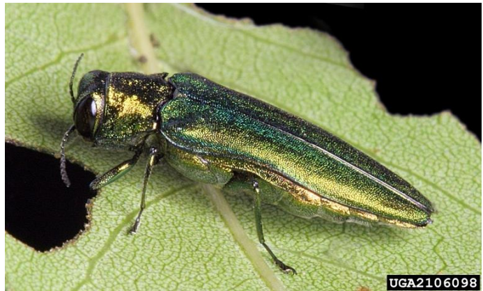
A. planipennis adult (Image courtesy of David Cappaert, Michigan State University, Bugwood.org).

“Mature larvae are 26 to 32 mm [approx. 1 to 1 ¼ in] long and creamy white in color. The body is flat and broad. The head is small and brown and it is retracted into the prothorax, exposing only the mouthparts. The prothorax is enlarged, and the meso- and meta-thorax are slightly narrower. The mesothorax bears spiracles. The abdomen is 10-segmented. Segments 1 to 8 have one pair of spiracles each and the last segment bears one pair of brownish, pincer-like appendages (urogomphi)” (Ciesla, 2003).