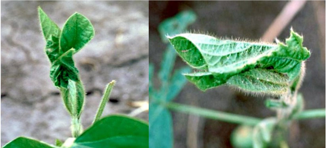
Figure 5. Leaf-rolls created by Crociosema aporema larvae.