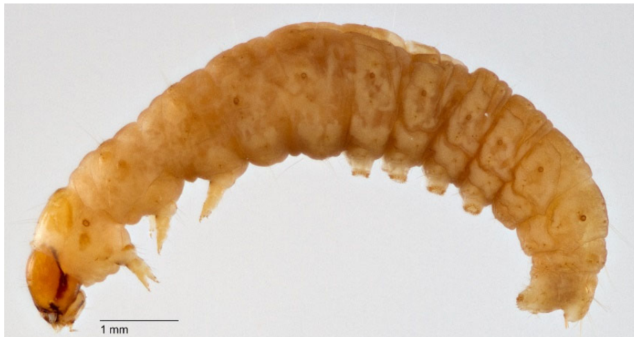
Figure 3. Late instar larva of Crocidosema aporema .

The body color is variable green to yellowish green. The head capsule is shiny and black in early instars (1–3) (Fig. 2). In later instars (4–5), the head is reddish brown with a lateral black dash on each side (Fig. 3). Fully grown larvae are approximately 10 mm (0.39 in) long (Morey, 1972).