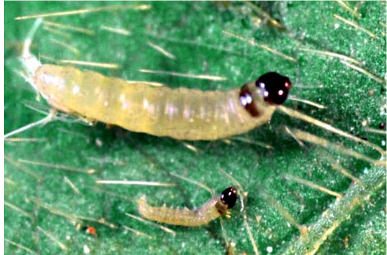
Figure 2. First (bottom) and third (top) instar Crocidosema aporema .

Adult moths are small and brown. The adult wingspan is 14 to 17 mm (approx. 0.55 to 0.67 in) wide (Morey, 1972; Ferreira, 1980) (Figs. 1a and b). Adults are nocturnal (Liljeström et al., 2001). During the day, adults rest within the vegetation, but flush and fly in short bursts if disturbed (Cano Ortiz, 1998; Wille, 1952). Daytime observations of adults are unlikely.